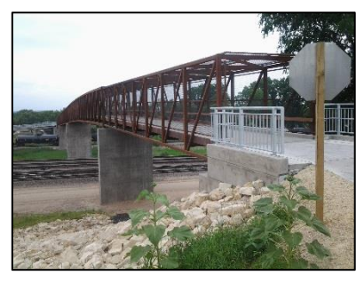
Figure 1: Picture of the Nature Trail bridge taken from its terminus at Oak St/ Enterprise Ave and looking west toward its terminus near Hamilton Rd and Salem Rd.

Beginning at its northern terminus at Oak St and Enterprise Ave, the Nature Trail crosses the BNSF rail yard via a bicycle and pedestrian bridge over 870 feet long (Figure 1) that touches down near Hamilton Rd and Salem Rd in Northside La Crosse. The Trail continues south for an additional 5,200 feet between the rail yard on its east and residential properties on its west to its southern terminus at Gillette St, just across from Logan High School. In total, the Trail is nearly 1.2 miles long.