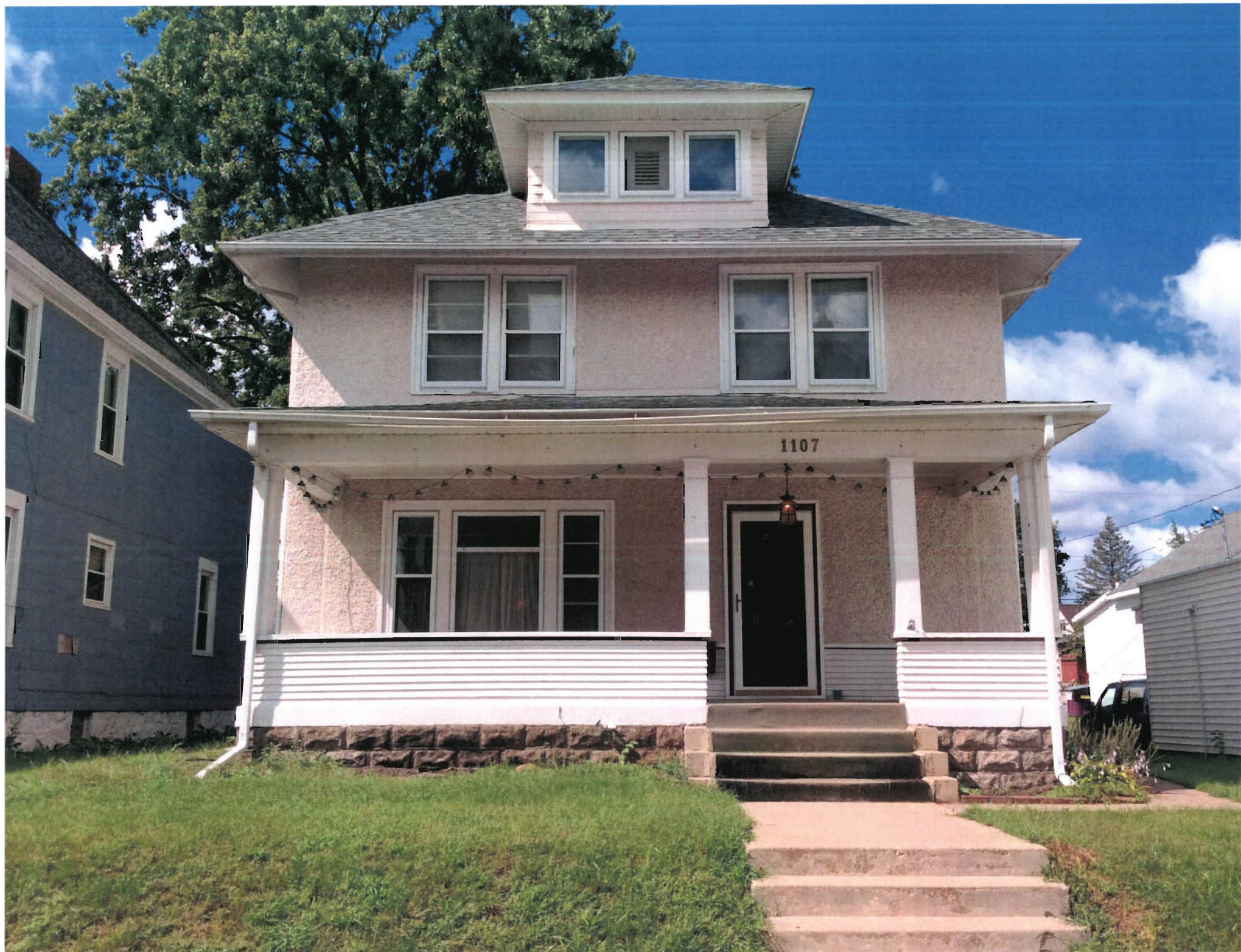
#1 1107 CALEDONIA ST. EAST ELEVATION (SEPT. 2016)