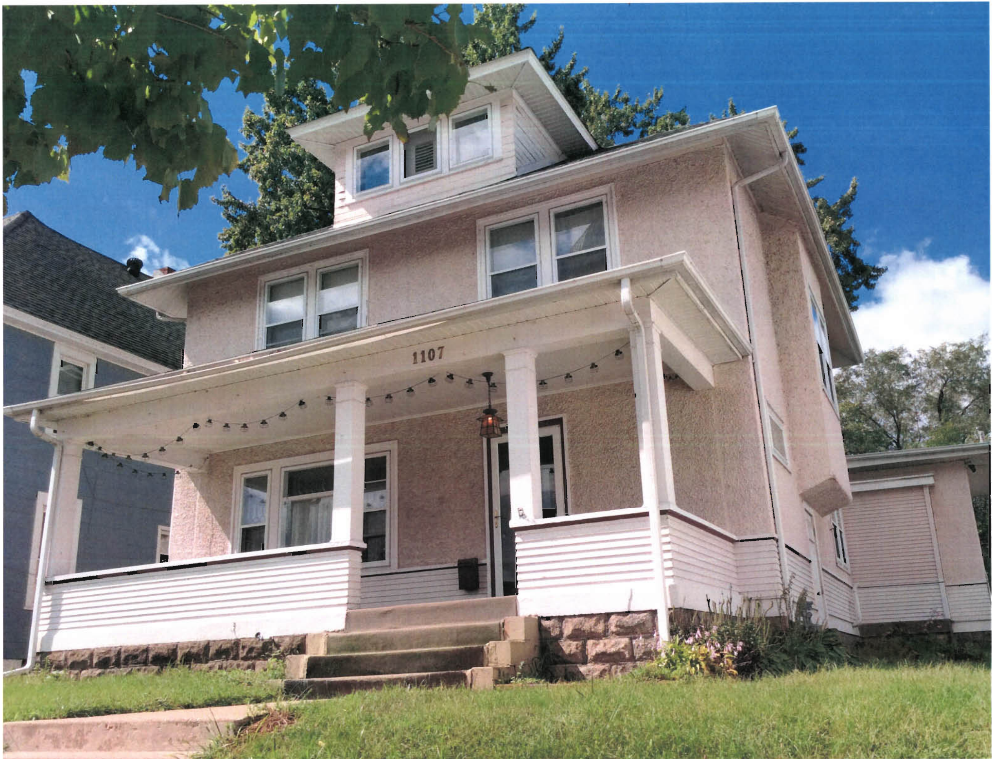
#2 1107 CALEDONIA ST. NORTHEAST CORNER SHOWING EAST + NORTH ELEVATIONS (SEPT. 2016)