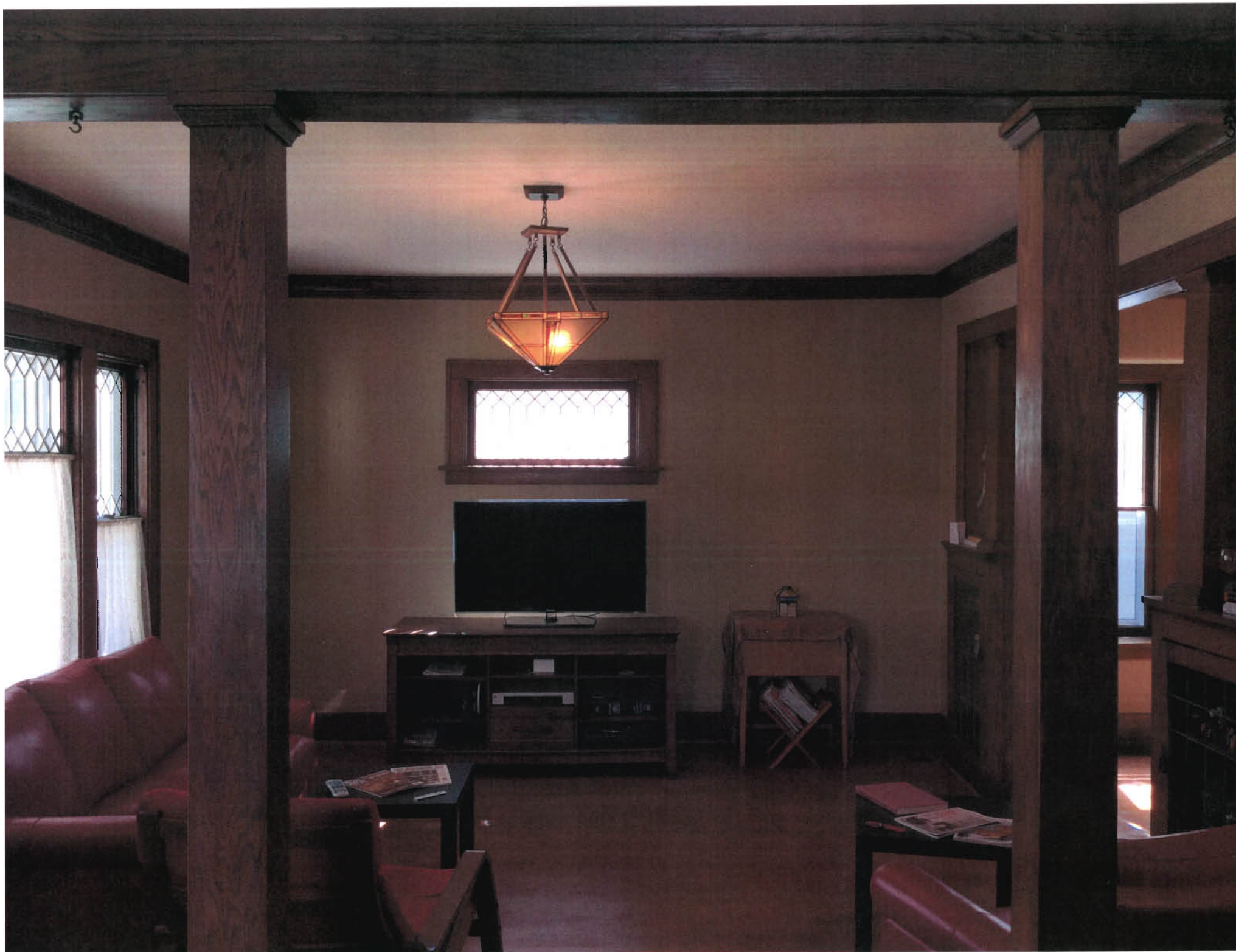
#8 1107 CALEDONIA STREET LIVING ROOM (SEPT 2016)