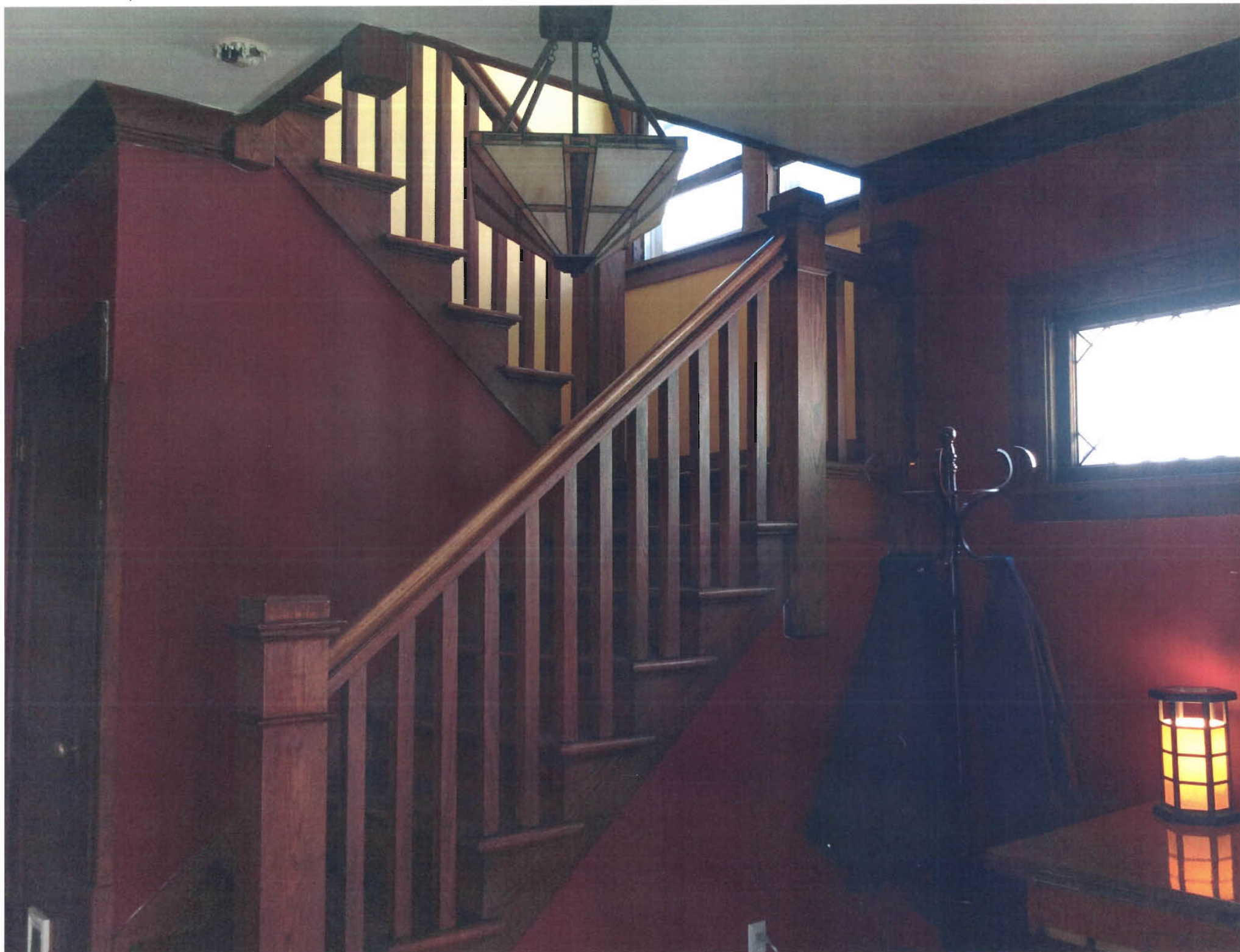
#7 1107 CALEDONIA STREET FOYER (SEPT 2016)