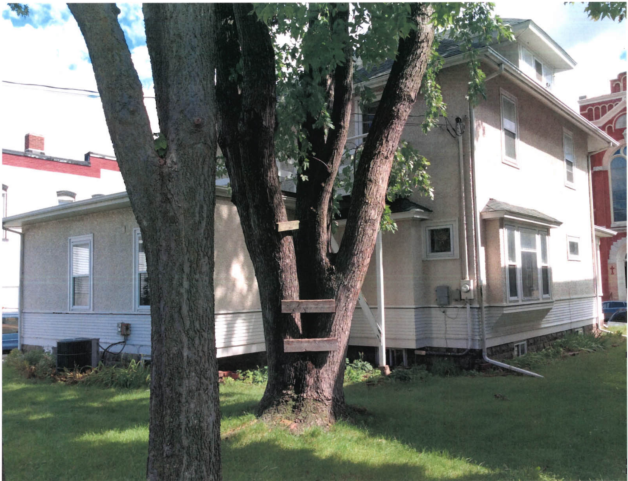
#3 1107 CALEDONIA ST. SOUTHWEST CORNER SHOWING WEST + SOUTH ELEVATIONS (SEPT. 2016)