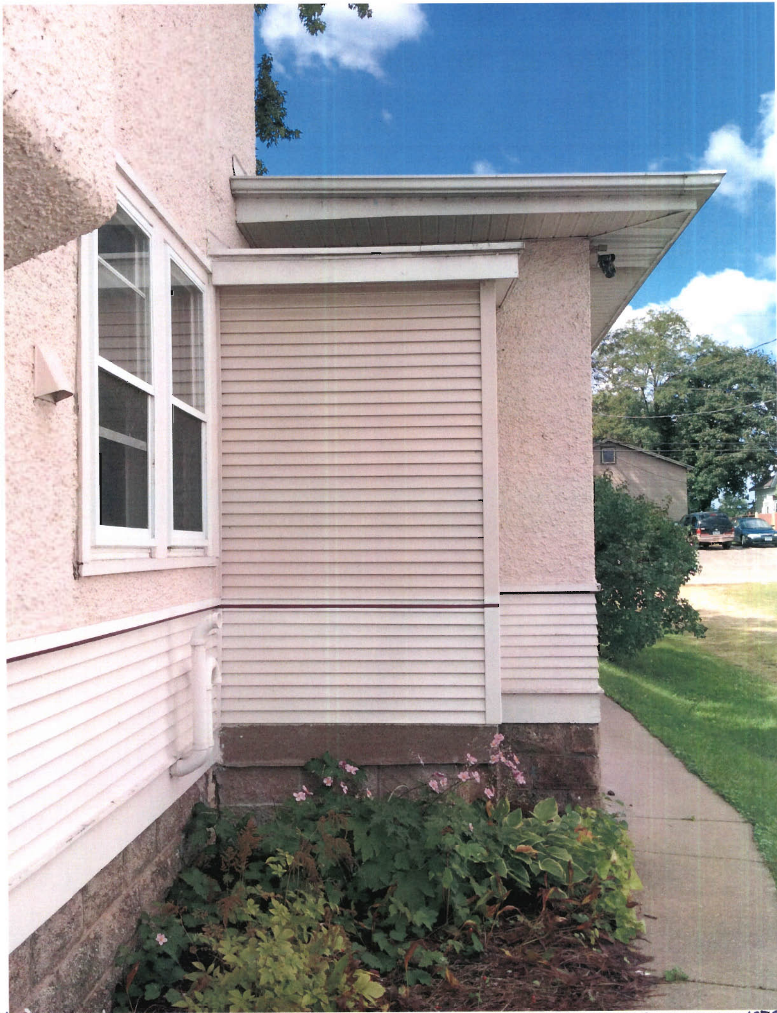
#11 1107 CALEDONIA STREET EXTERIOR SHOT - ENTRANCE NOW A CLOSET (SEE)