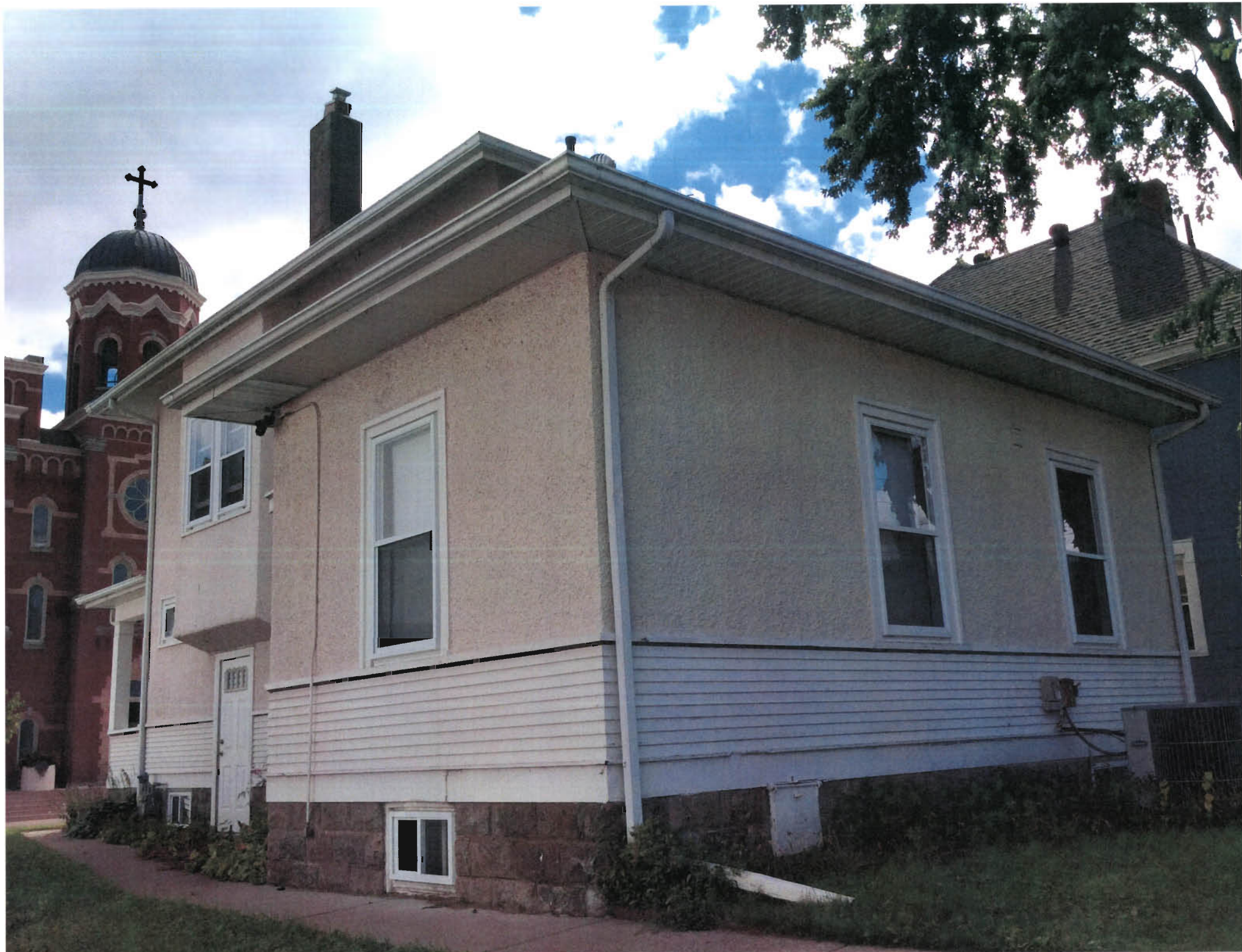
#5 1107 CALEDONIA STREET NORTHWEST CORNER SHOWING NORTH + WEST ELEVATIONS (SEPT. 2016)