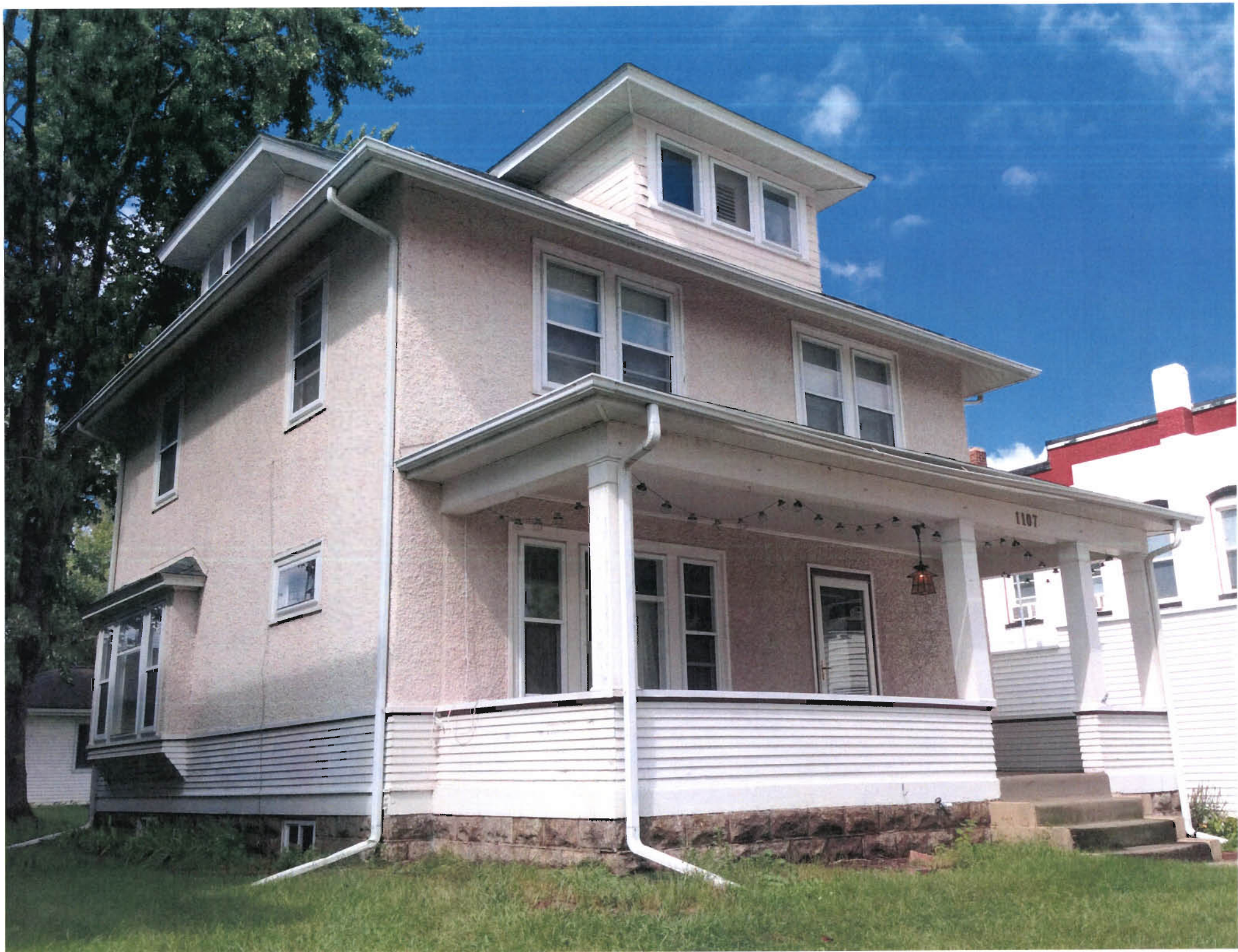
#4 1107 CALEDONIA ST. SOUTHEAST CORNER SHOWING SOUTH + EAST ELEVATIONS (SEPT. 2016)