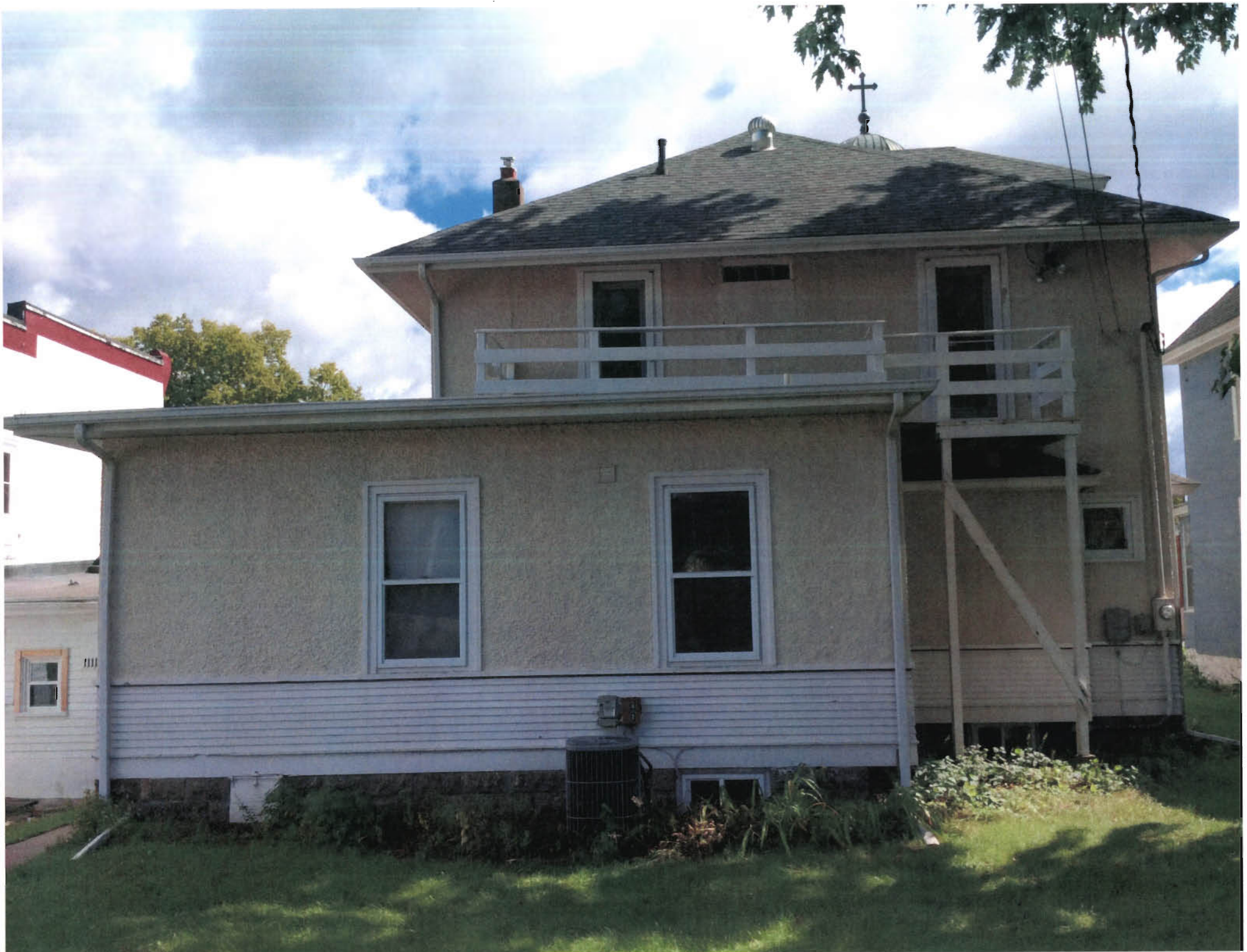
#6 1107 CALEDONIA STREET WEST ELEVATION (SEPT 2016)