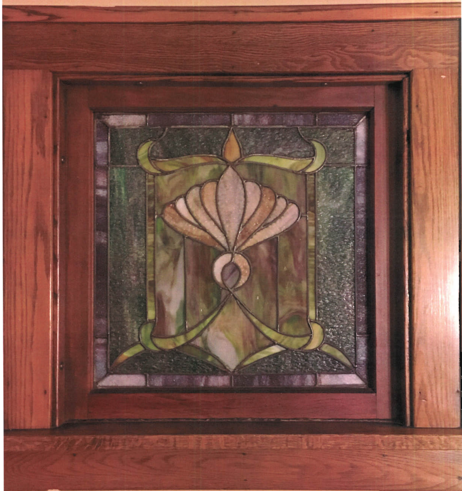
#10 1107 CALEDONIA ST. DINING ROOM STAINED GLASS WINDOW (SEPT 2016)