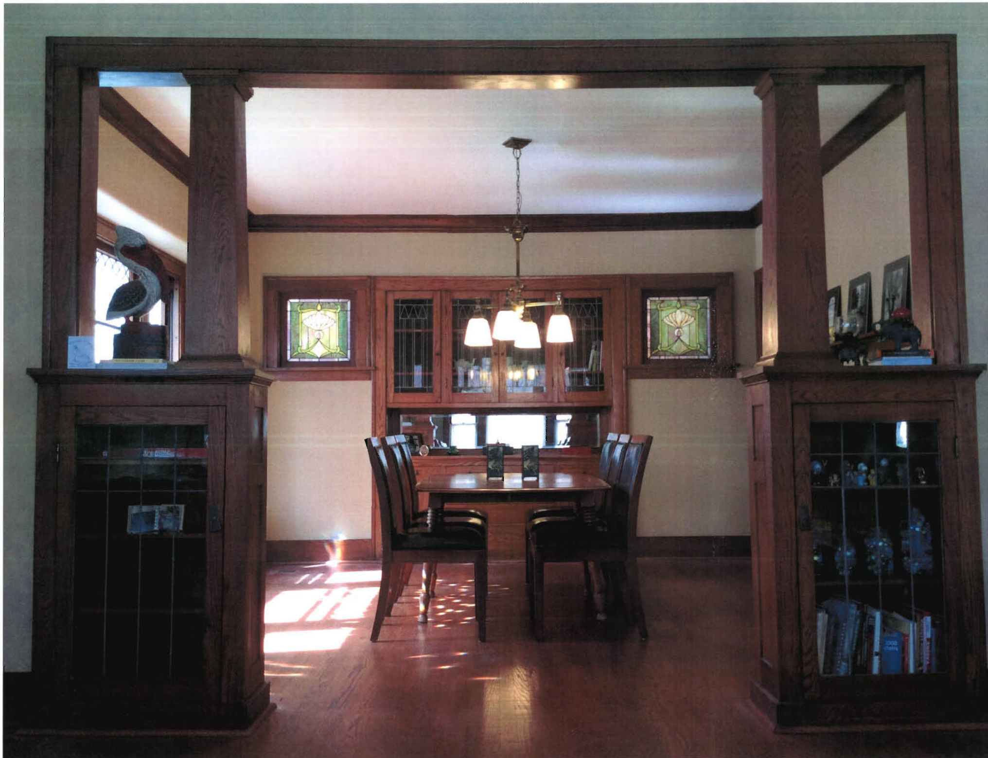
# 9 1107 CALEDONIA ST. DINING ROOM (SEPT 2016)