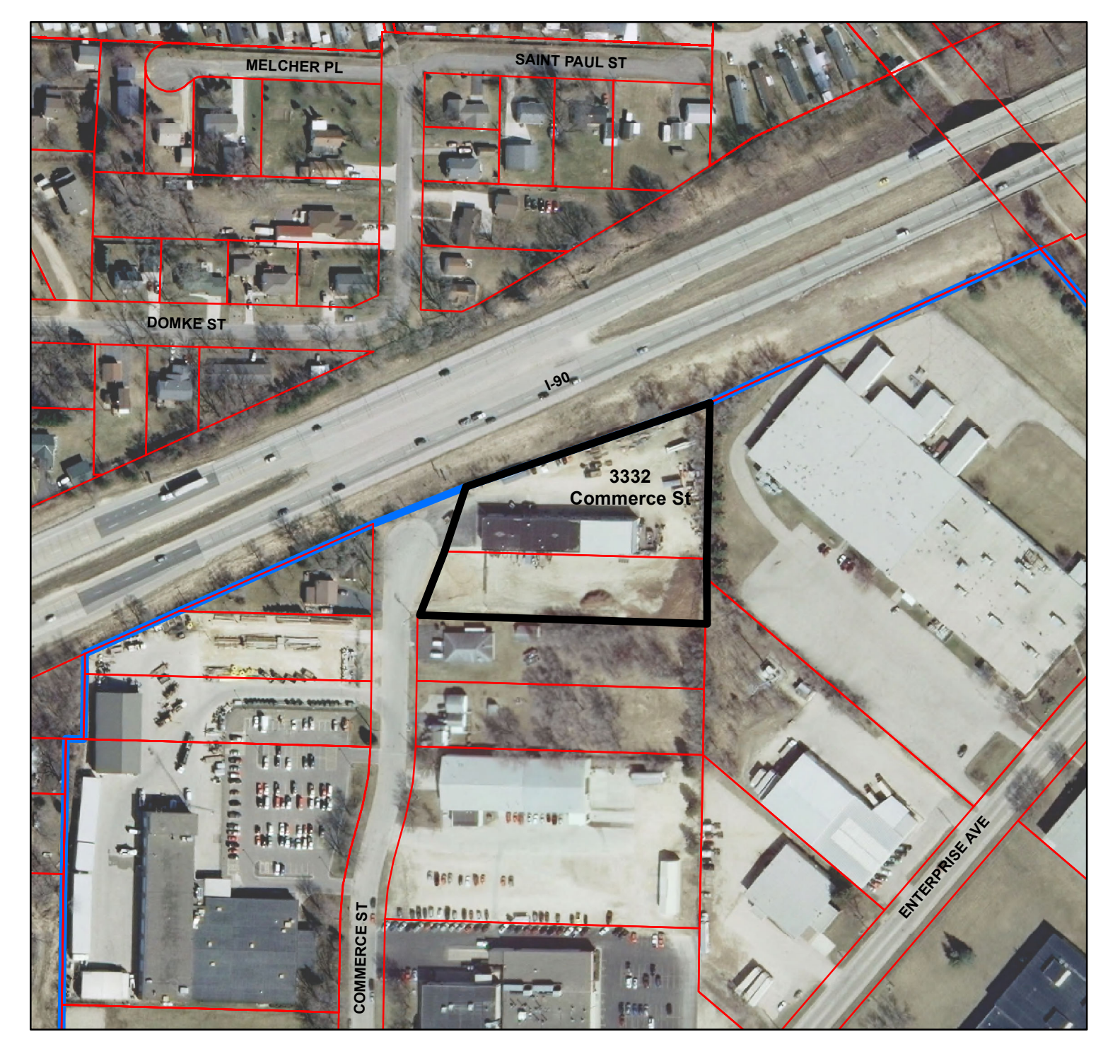
BASIC ZONING DISTRICTS R1 - SINGLE FAMILY R2 - RESIDENCE