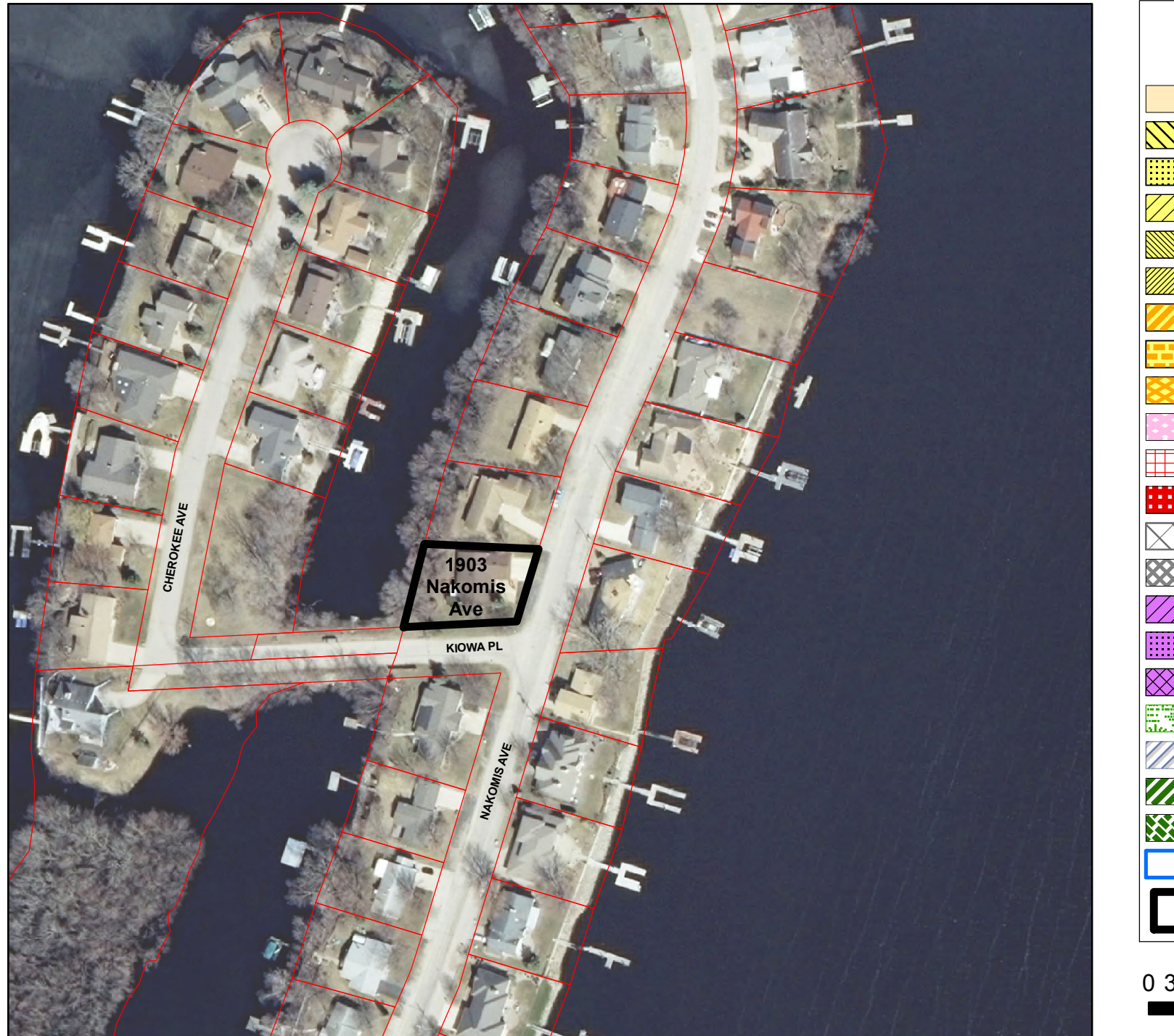
City of La Crosse Planning Department - 2016