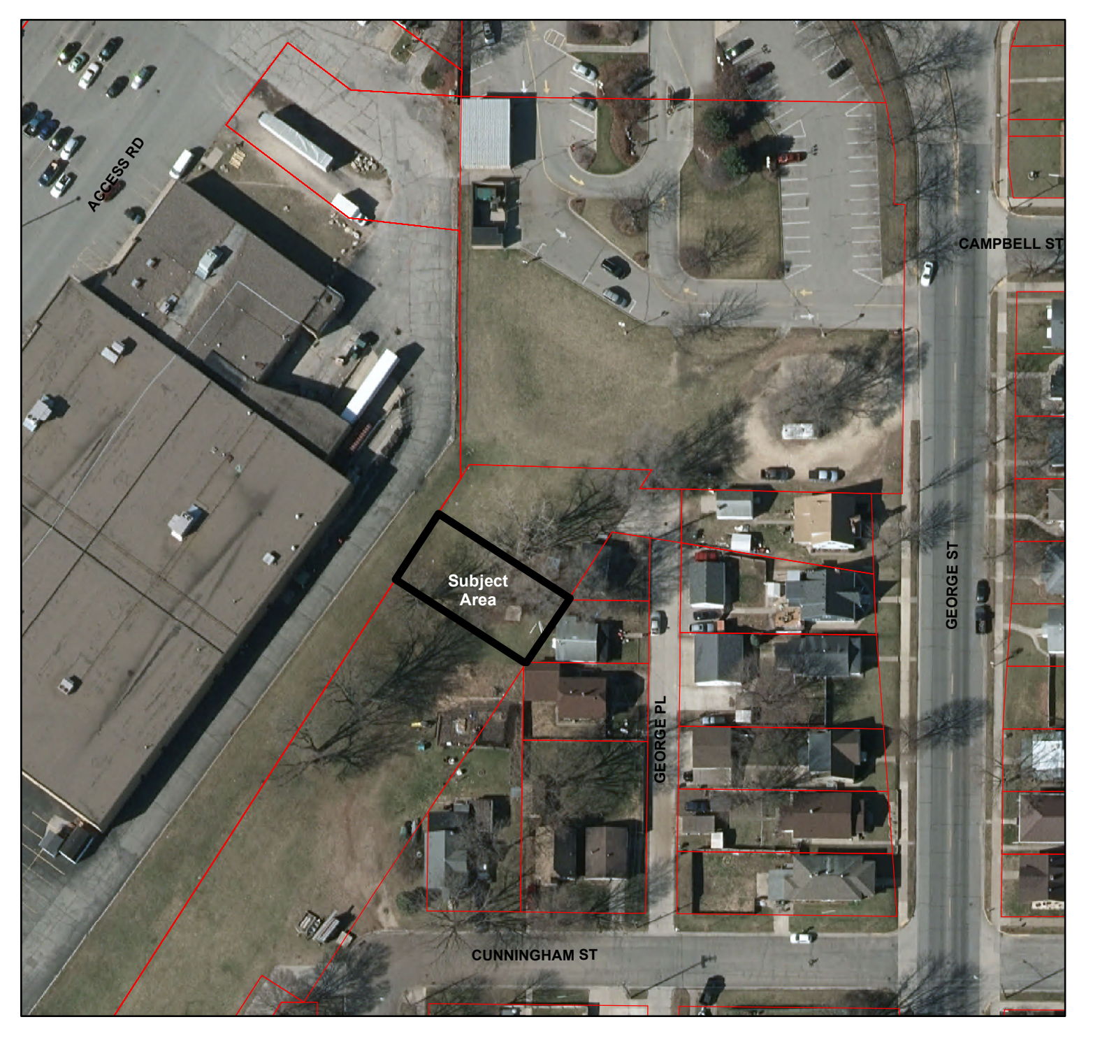
City of La Crosse Planning Department - 2016