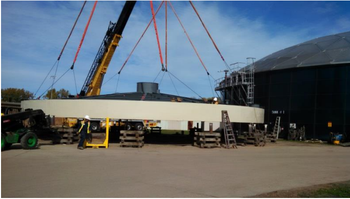
Digester 3 Rehabilitation