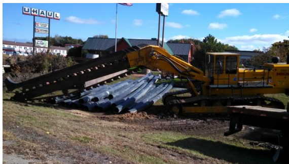
Storm Sewer Projects