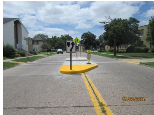
GENA Capital Infrastructure Project