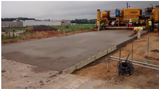
River Valley Drive