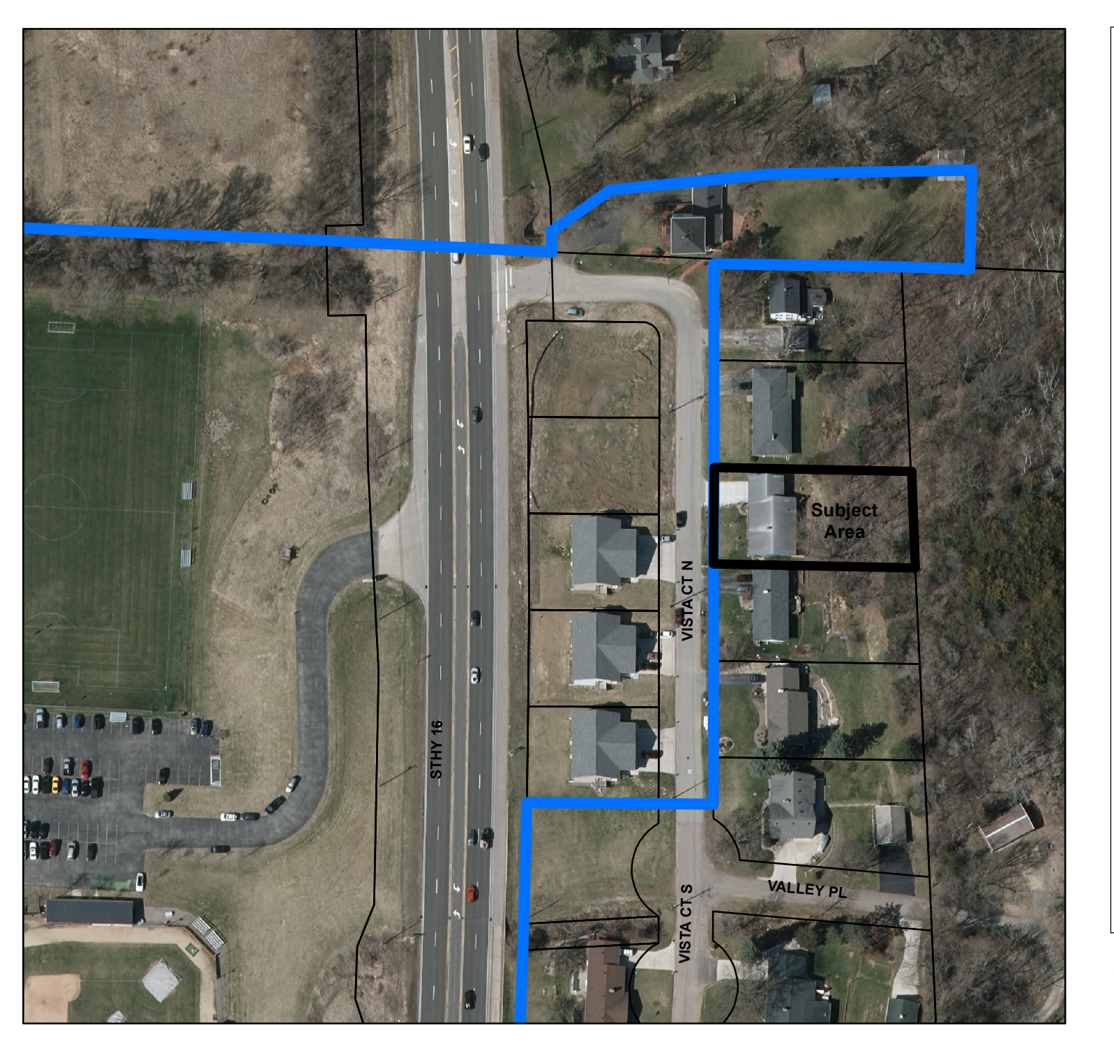
City of La Crosse Planning Department - 2017