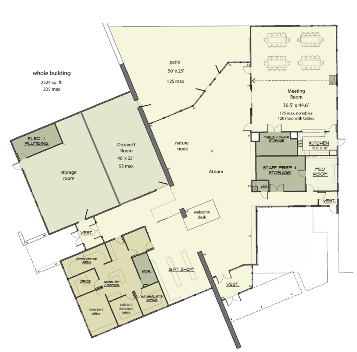
EXHIBIT "B" Floor Plan