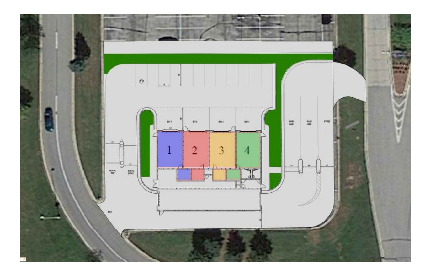
EXHIBIT A3 - CITY'S PLANNED AUTOMATED CAR WASH AND SERVICE BAYS (Conceptual Drawing – Not Yet Designed)