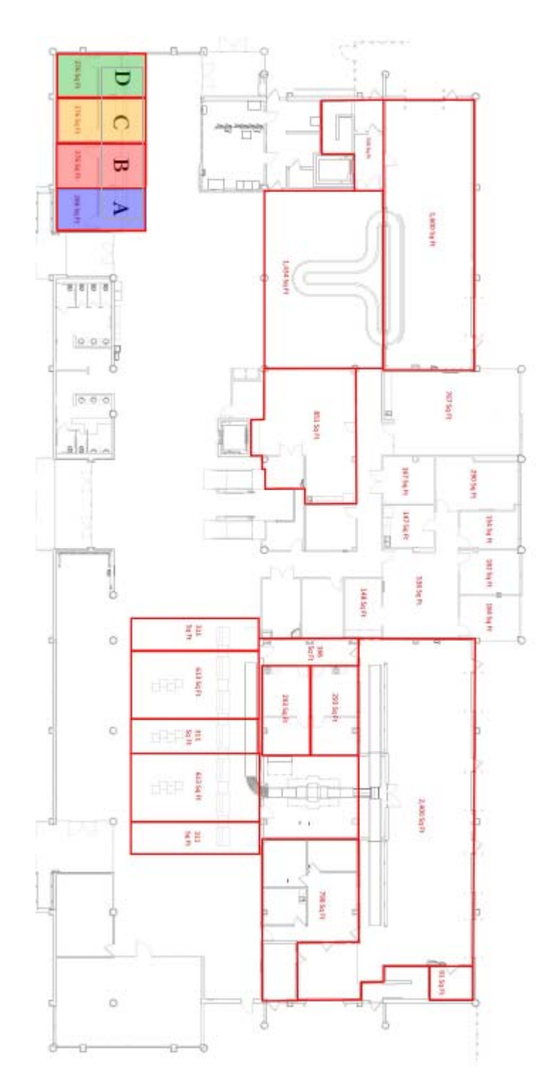
EXHIBIT A1 - COUNTER/OFFICE/QUEUING AREAS