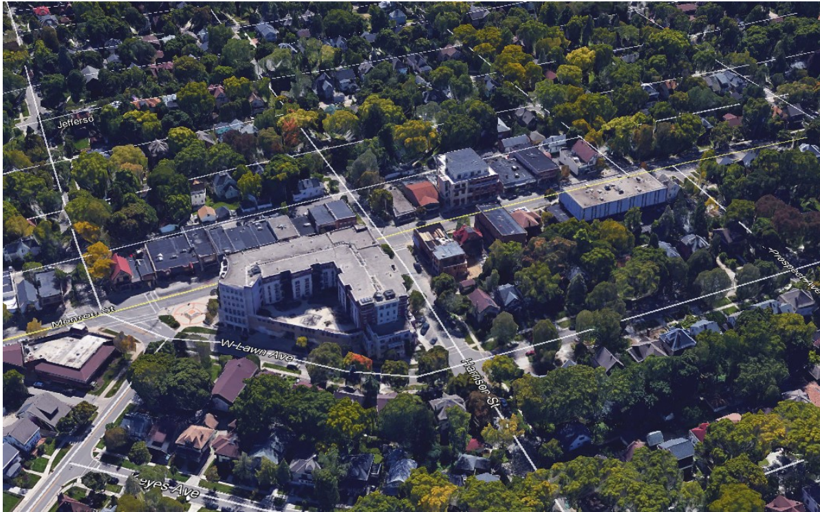
Madison's Monroe Street Mixed Use District