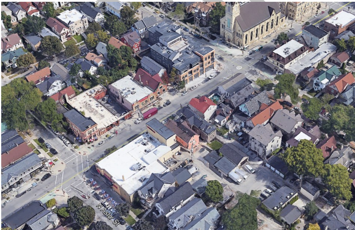
Milwaukee's Brady Street Mixed Use District