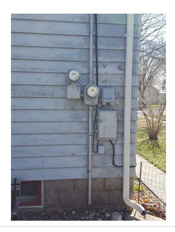
Uploaded: 7/5/2018 Kevin Conroy