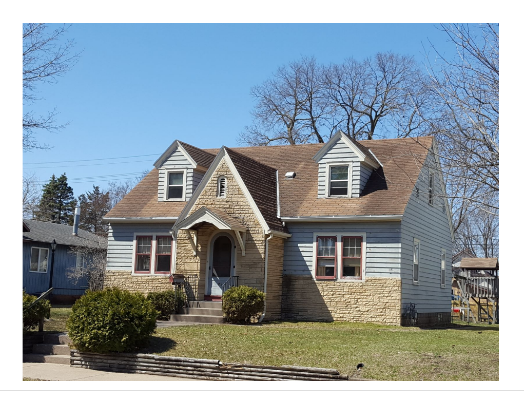
Uploaded: 7/5/2018 Kevin Conroy