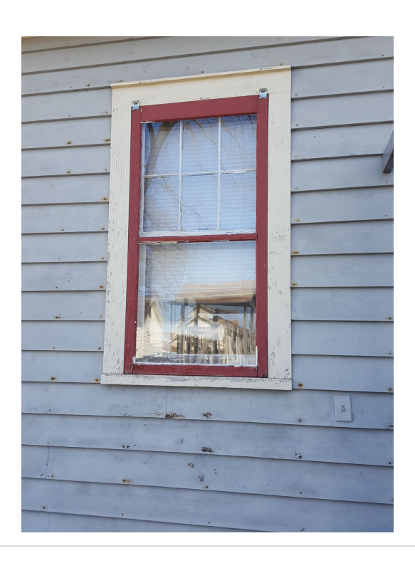
Uploaded: 7/5/2018 Kevin Conroy