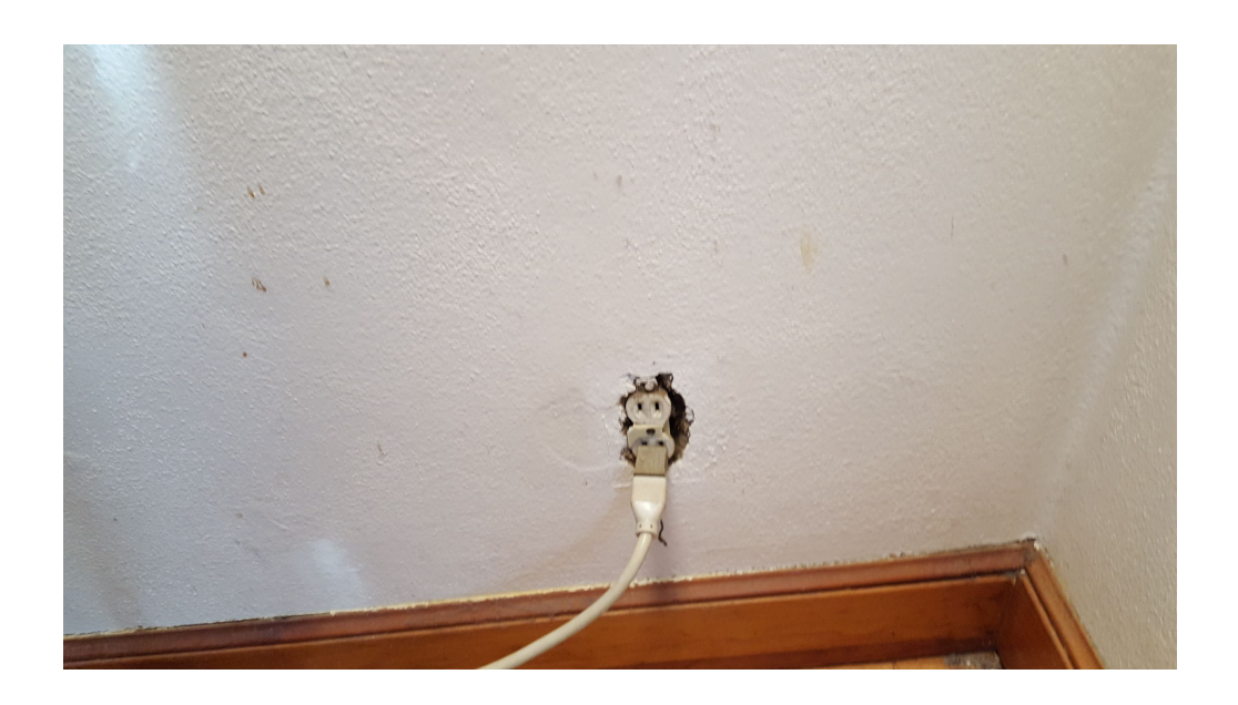
Uploaded: 9/6/2018 Kevin Conroy