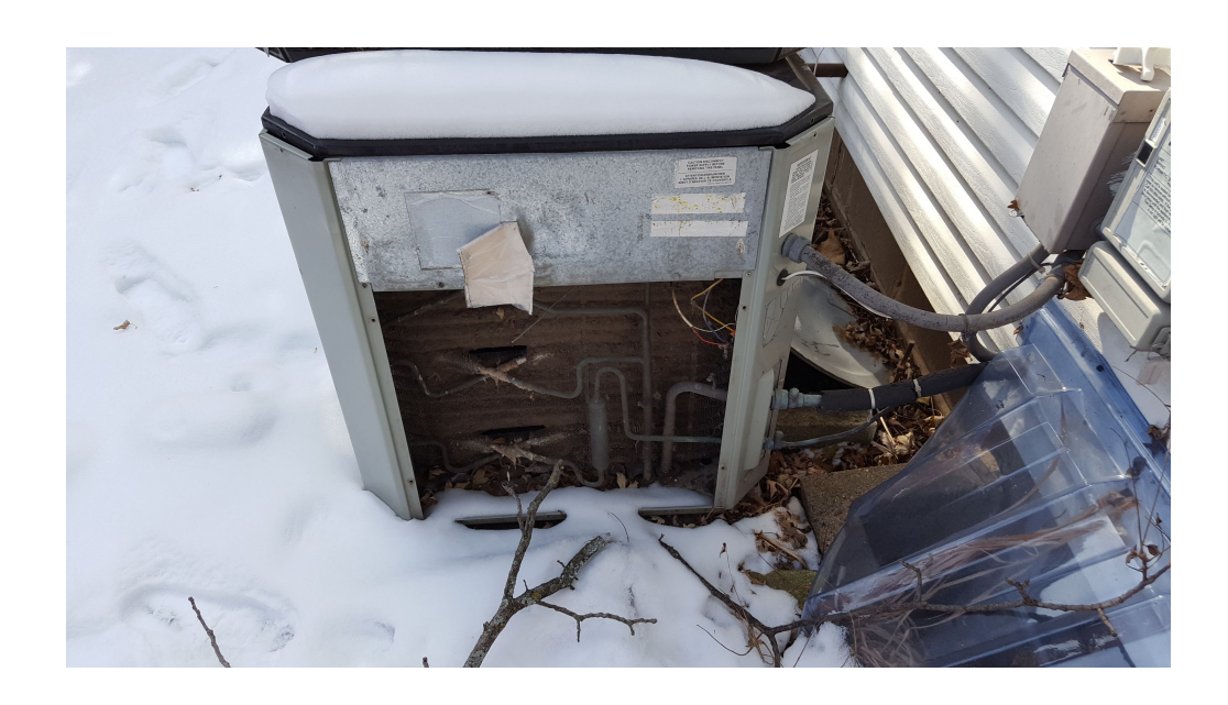
Uploaded: 9/6/2018 Kevin Conroy