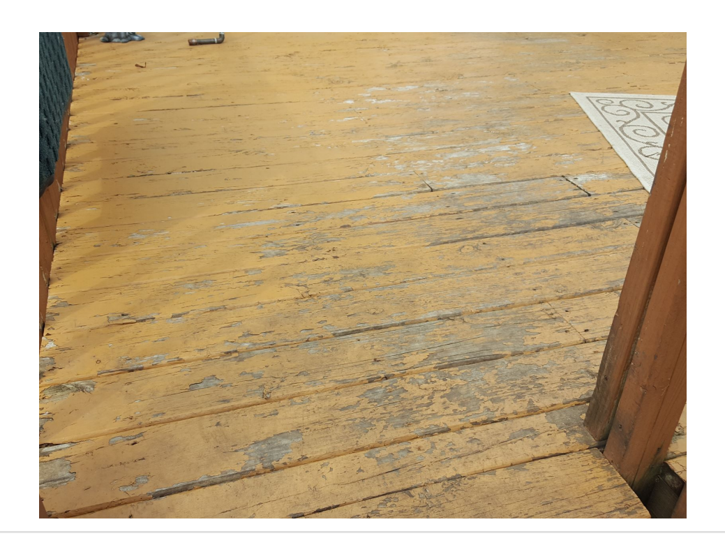
Uploaded: 11/7/2018 Kevin Conroy