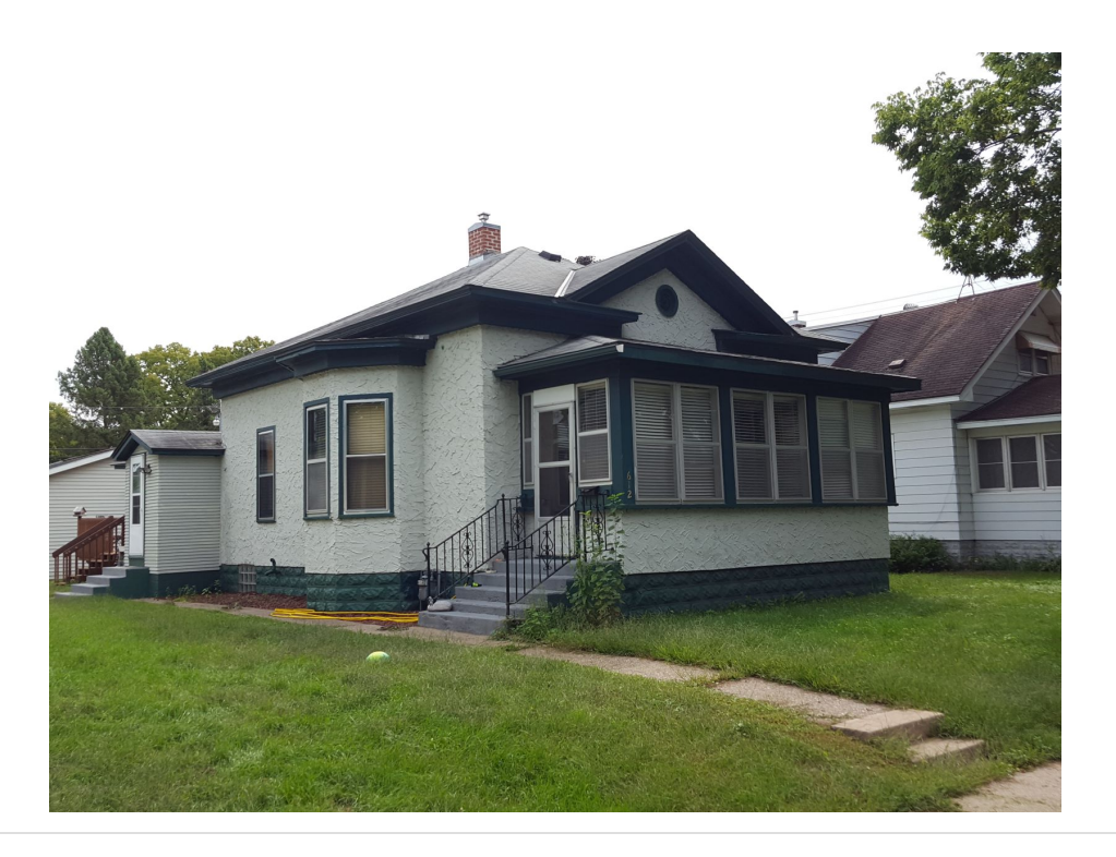
Uploaded: 11/7/2018 Kevin Conroy