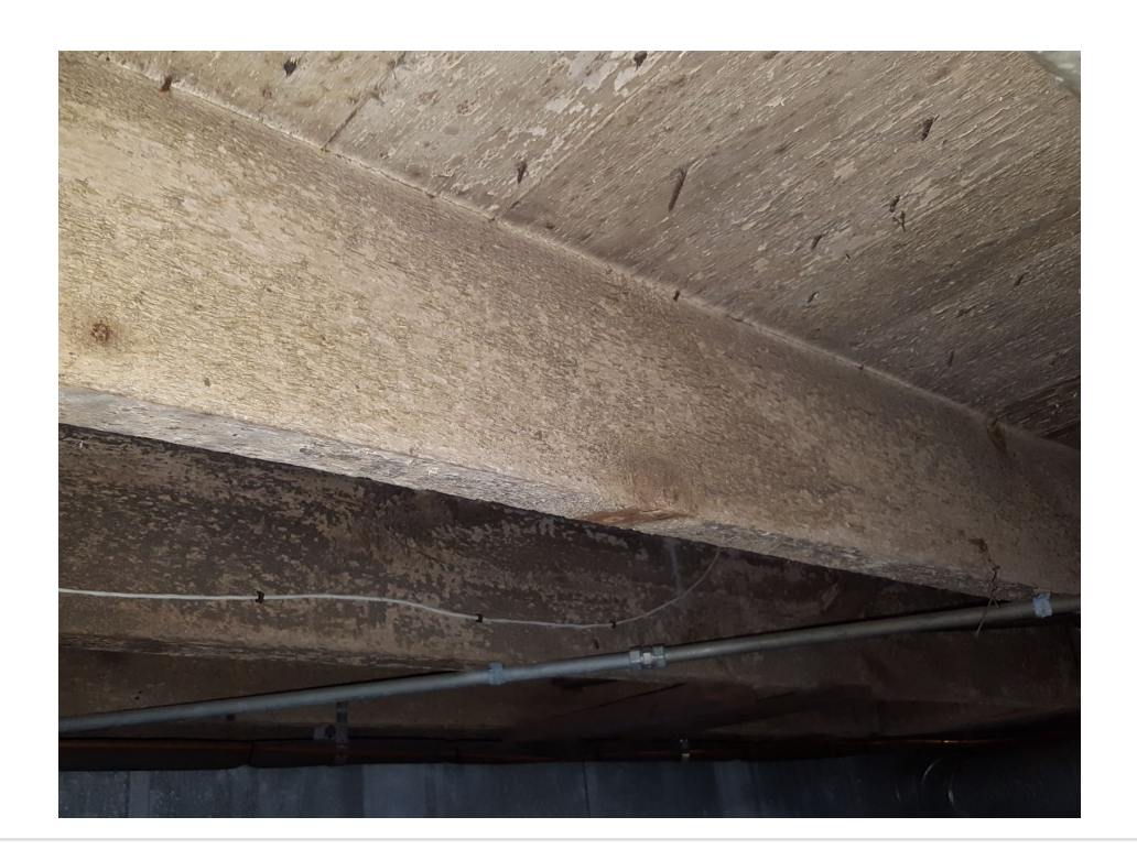
Uploaded: 11/7/2018 Kevin Conroy