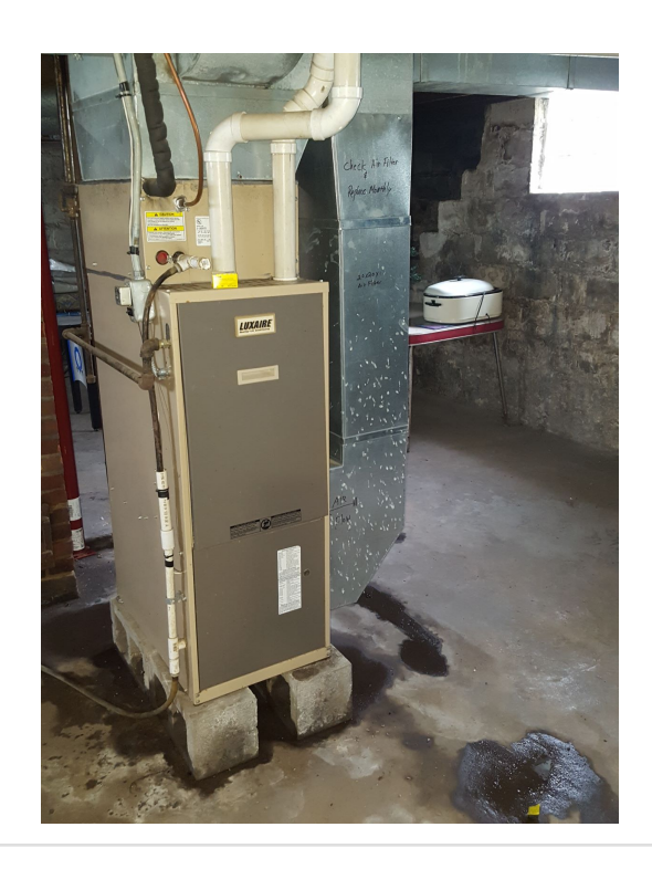
Uploaded: 11/7/2018 Kevin Conroy