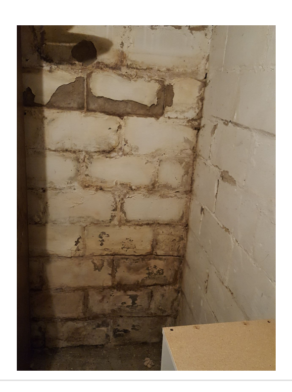
Uploaded: 11/8/2018 Kevin Conroy