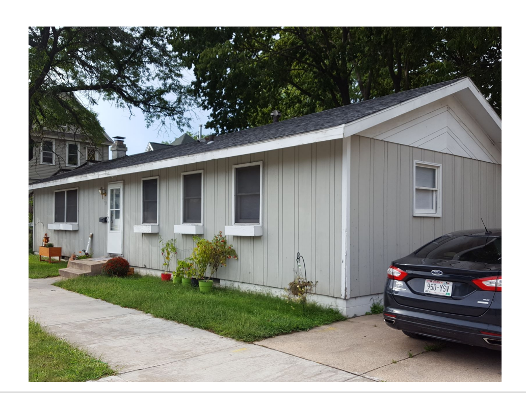
Uploaded: 11/8/2018 Kevin Conroy