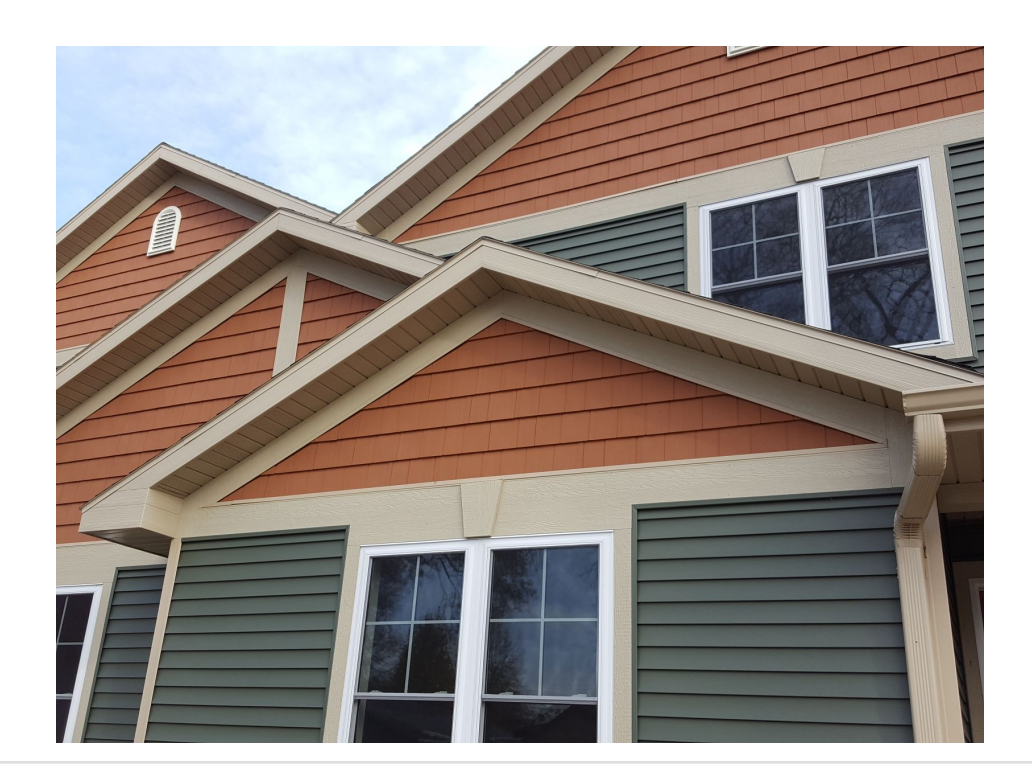
Uploaded: 11/8/2018 Kevin Conroy