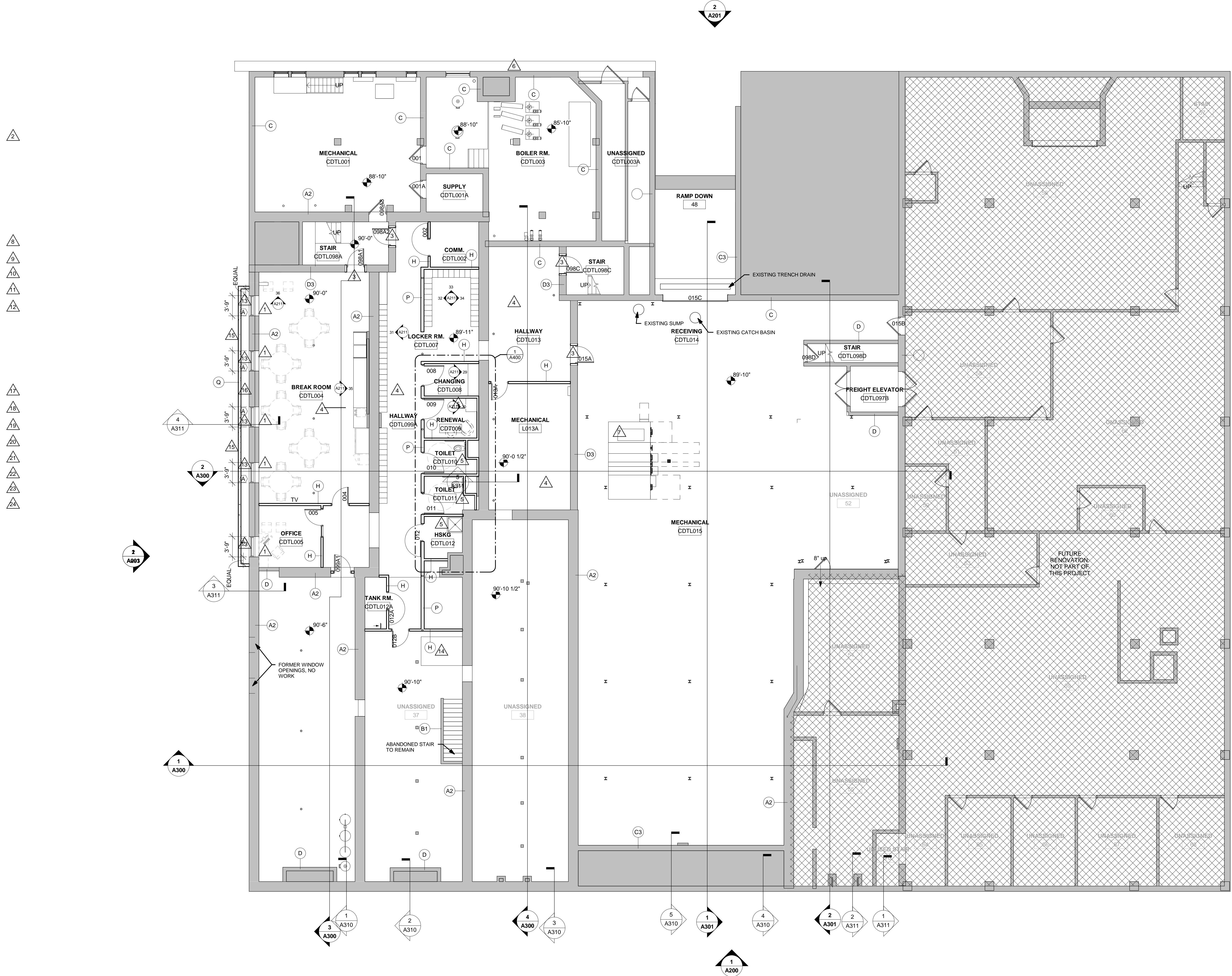
1 LOWER LEVEL REMODEL PLAN