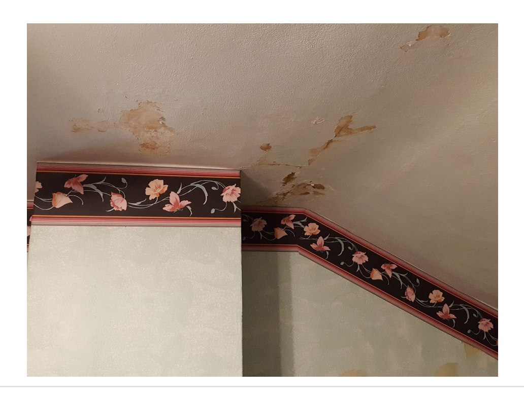
Uploaded: 4/2/2019 Kevin Conroy