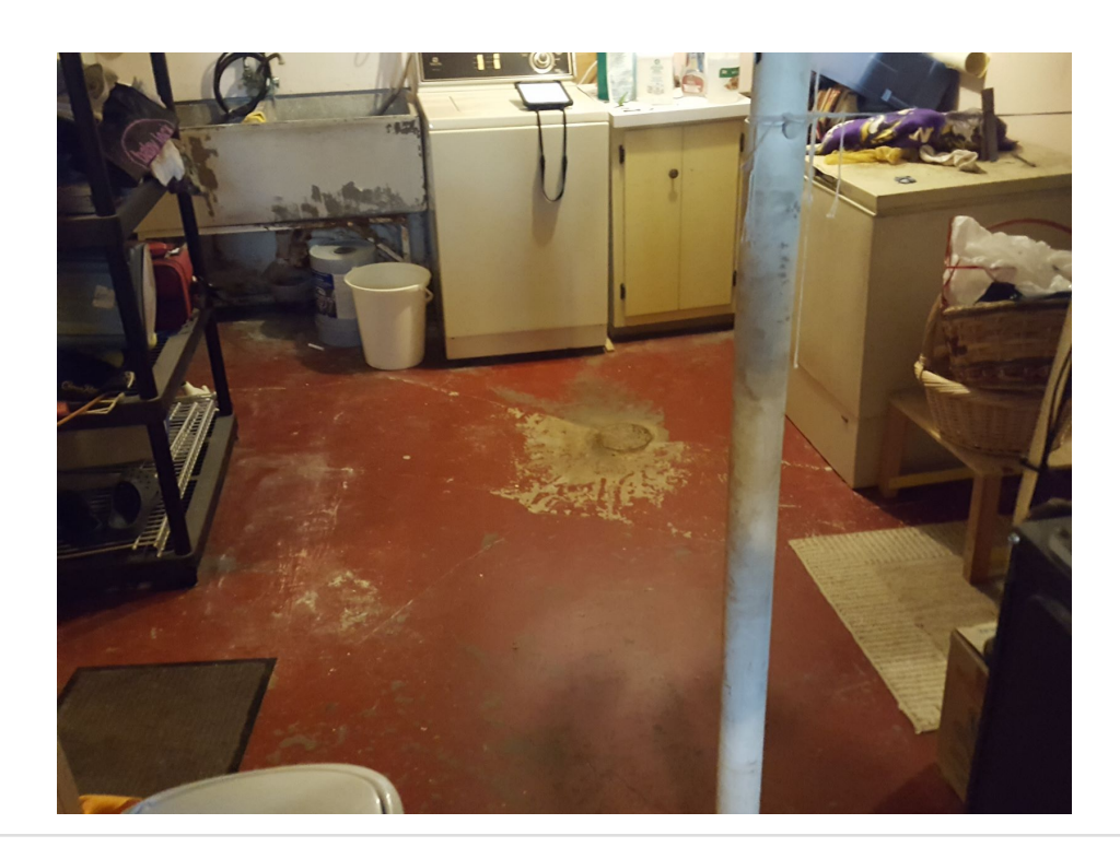
Uploaded: 4/2/2019 Kevin Conroy