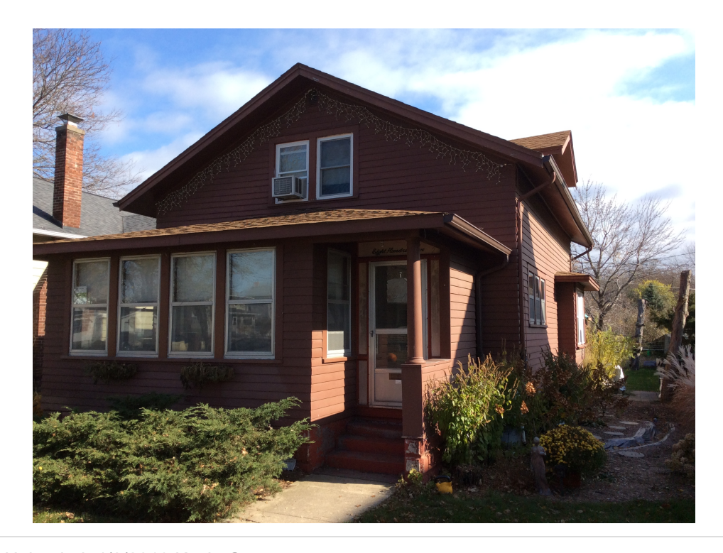
Uploaded: 4/2/2019 Kevin Conroy