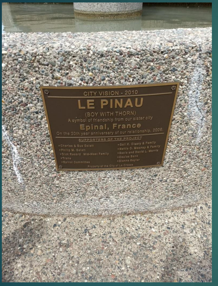
Condition Very good