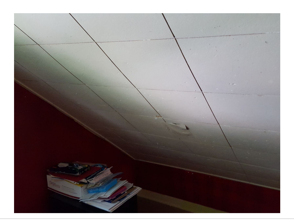
Uploaded: 12/6/2018 Kevin Conroy