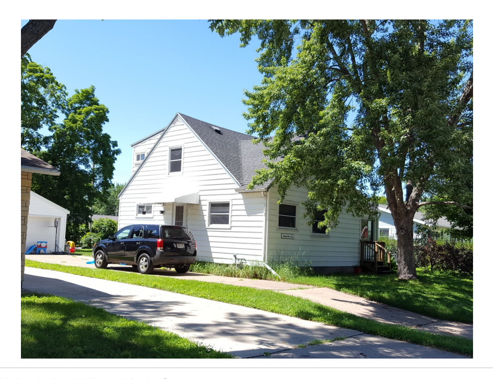
Uploaded: 12/6/2018 Kevin Conroy