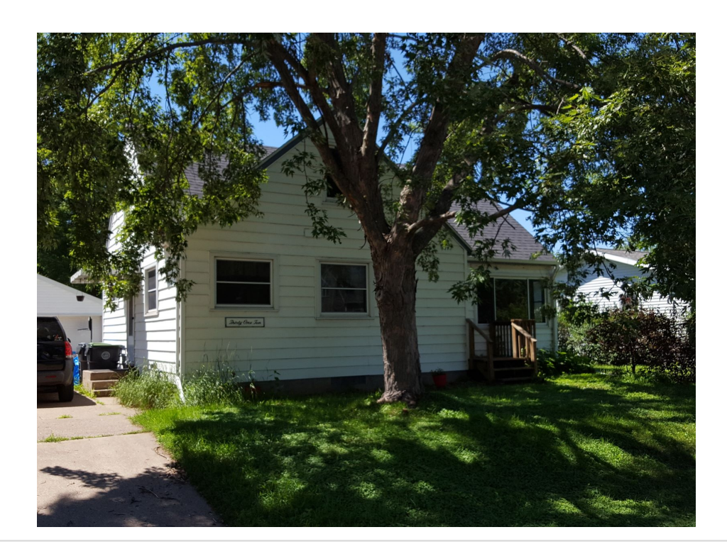
Uploaded: 12/6/2018 Kevin Conroy