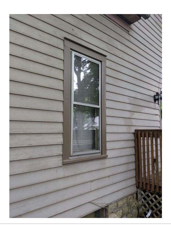
Uploaded: 8/22/2019 Kevin Conroy