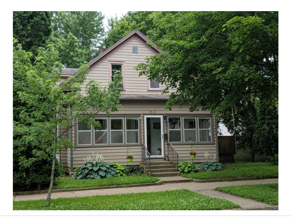
Uploaded: 8/22/2019 Kevin Conroy