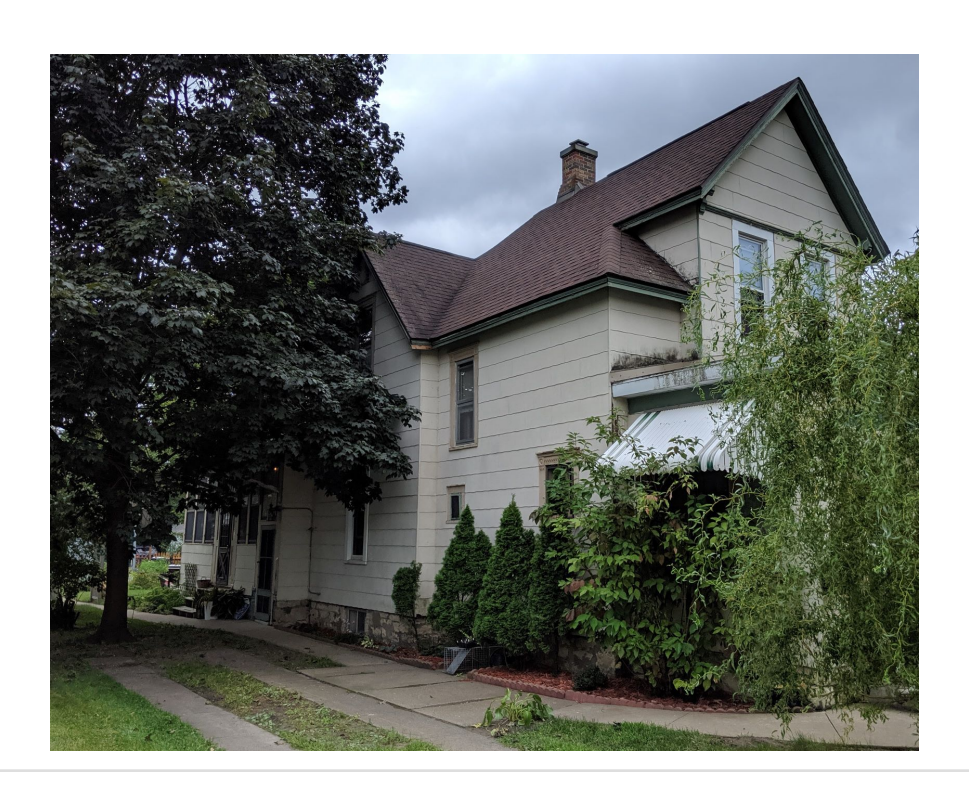
Uploaded: 9/3/2019 Kevin Conroy