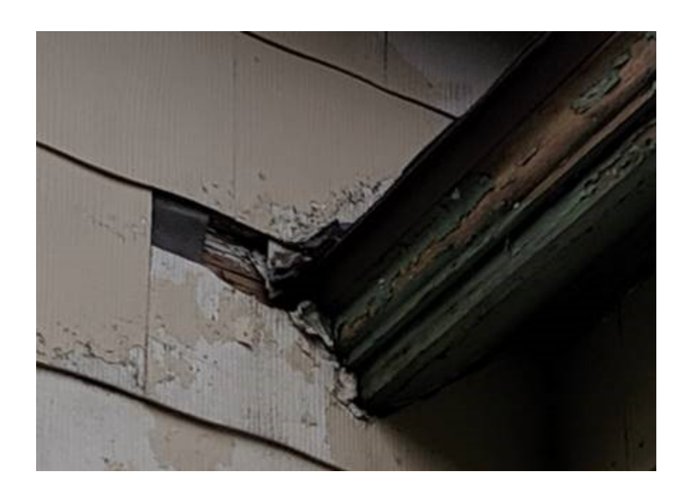
Uploaded: 9/3/2019 Kevin Conroy