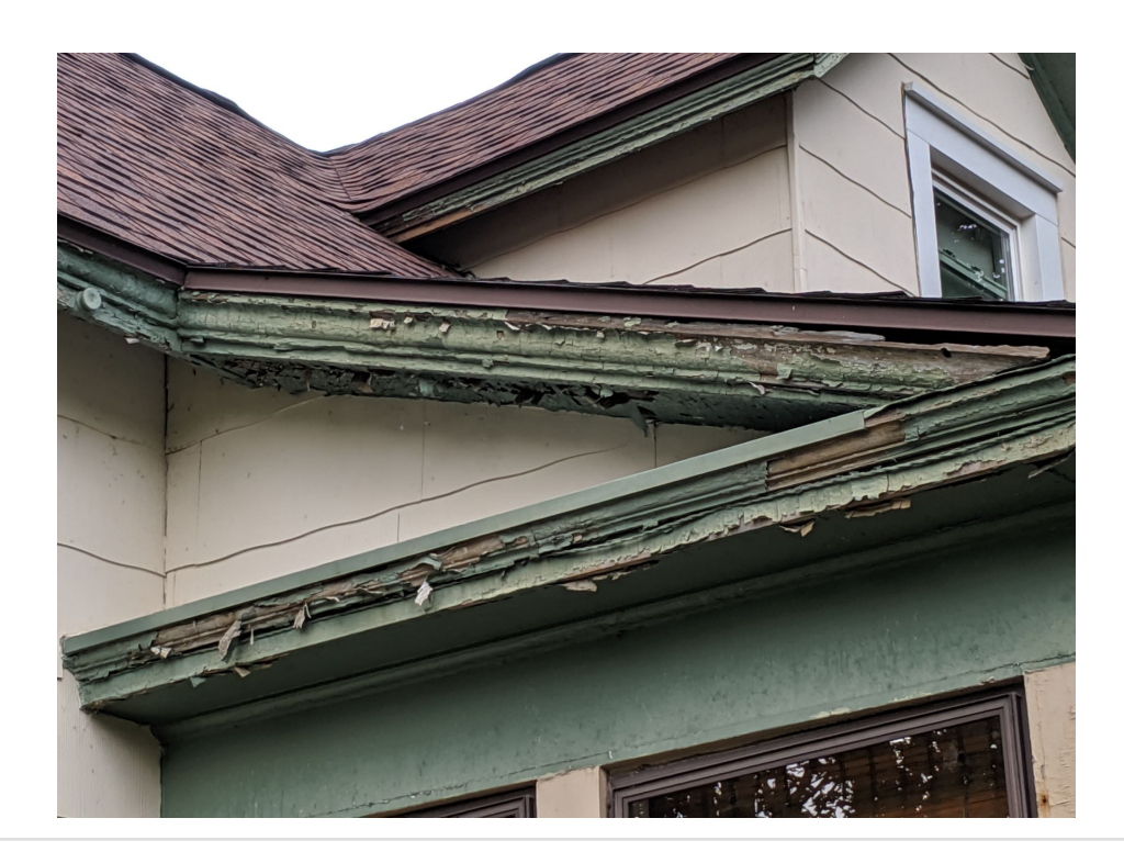
Uploaded: 9/3/2019 Kevin Conroy