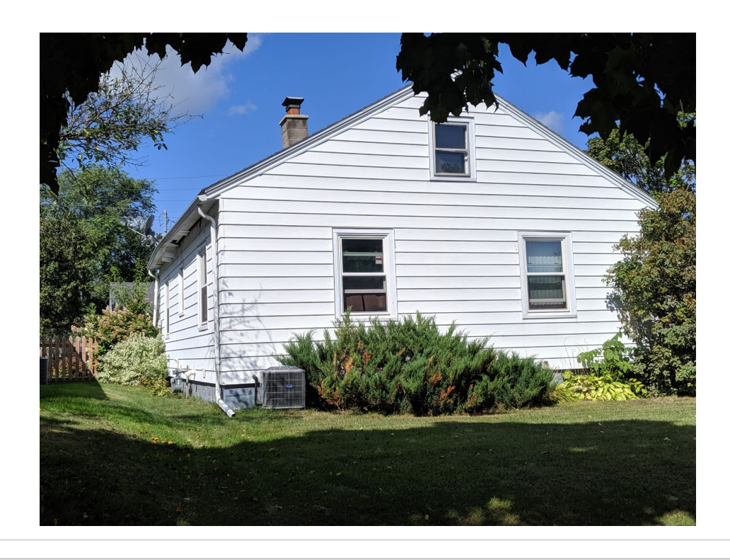
Uploaded: 9/3/2019 Kevin Conroy