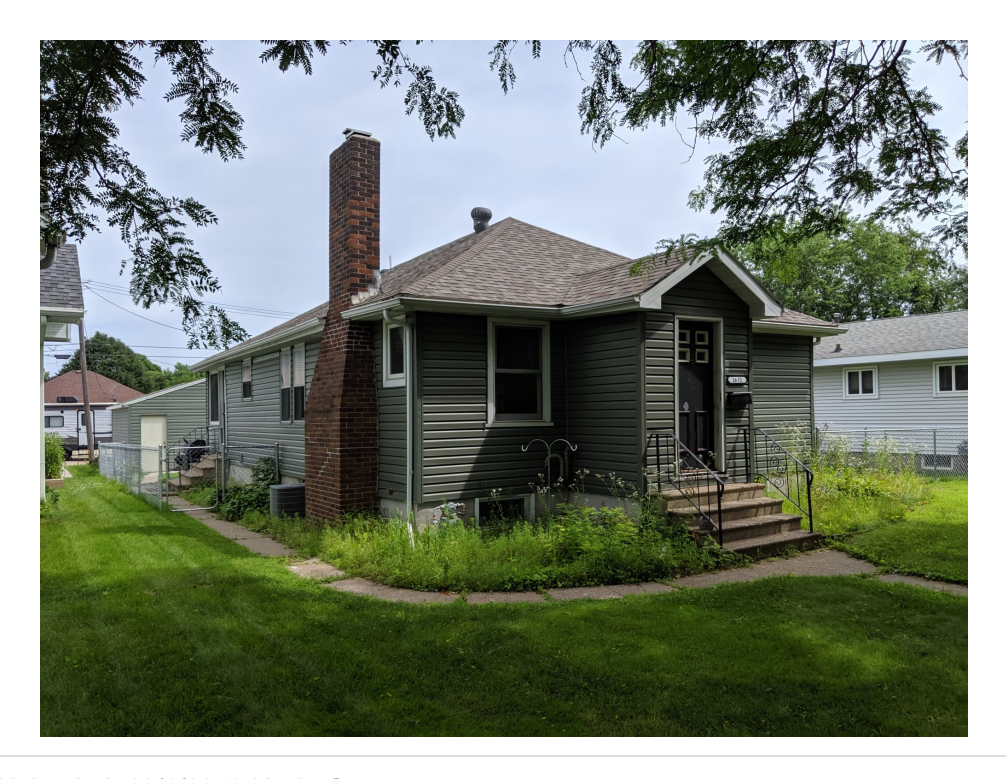
Uploaded: 10/1/2019 Kevin Conroy