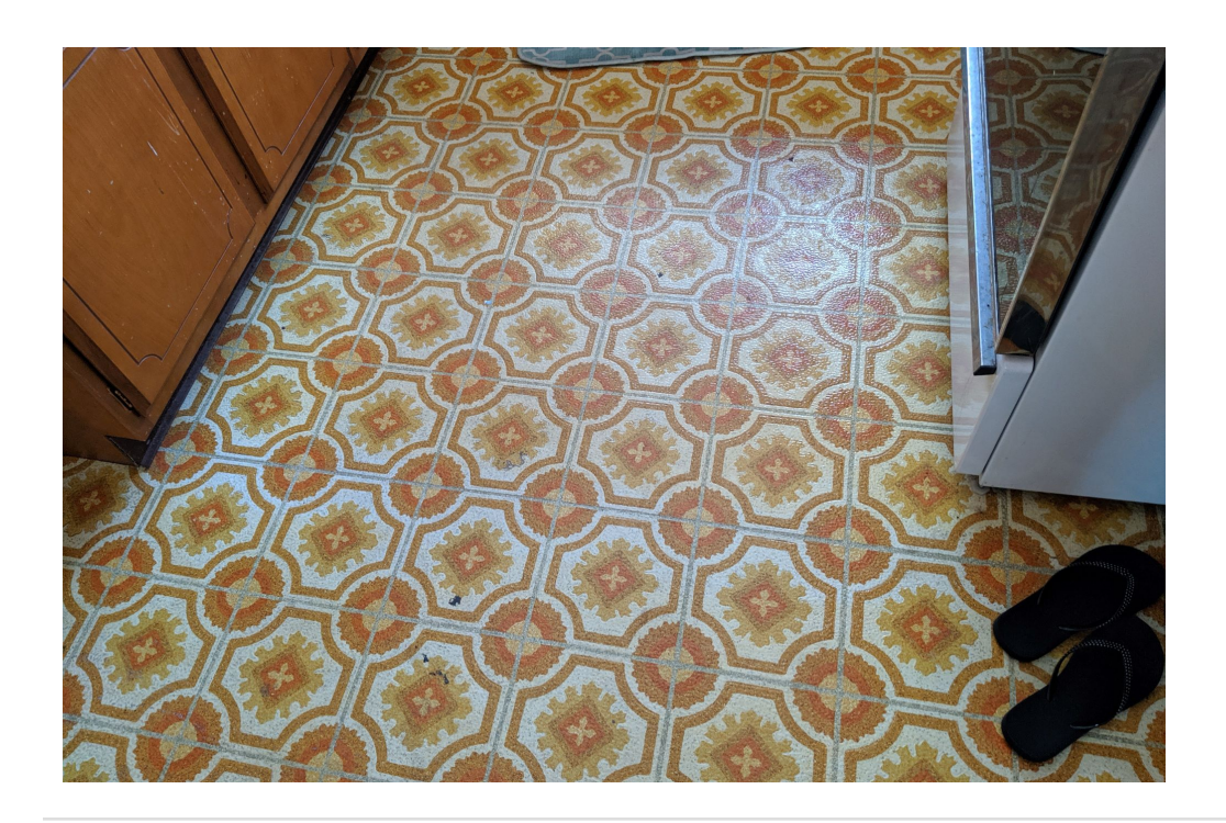
Uploaded: 9/23/2019 Kevin Conroy