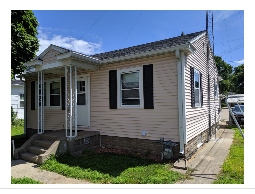
Uploaded: 9/23/2019 Kevin Conroy