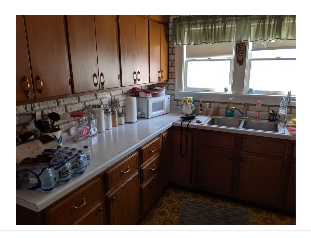
Uploaded: 9/23/2019 Kevin Conroy