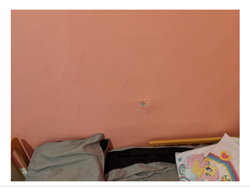
Uploaded: 1/8/2020 Kevin Conroy