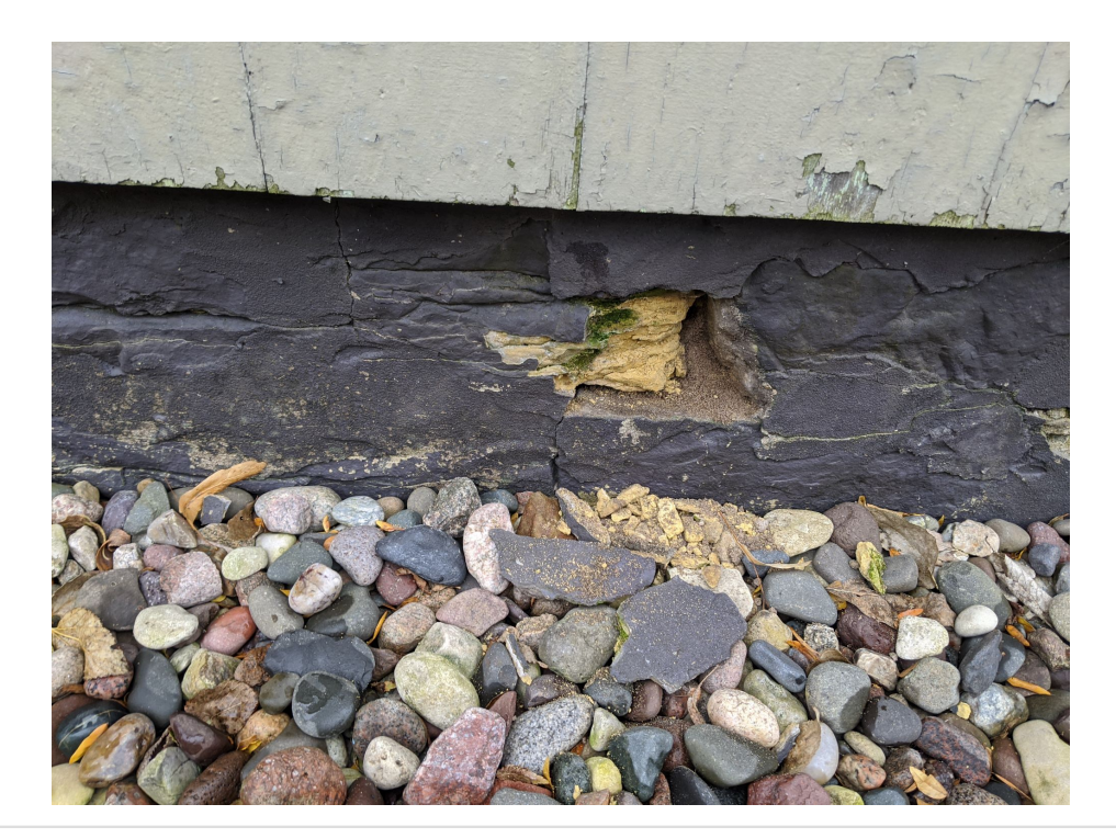
Uploaded: 1/8/2020 Kevin Conroy