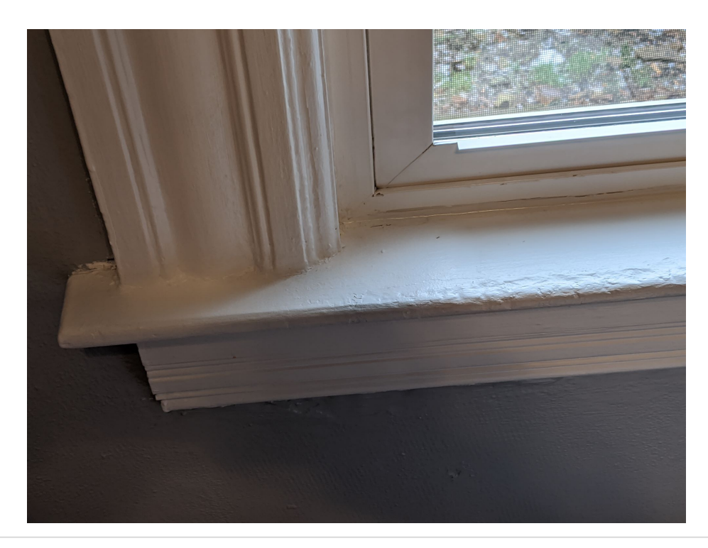
Uploaded: 1/8/2020 Kevin Conroy