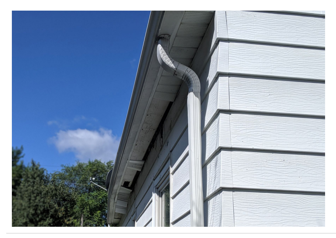
Uploaded: 9/4/2019 Kevin Conroy