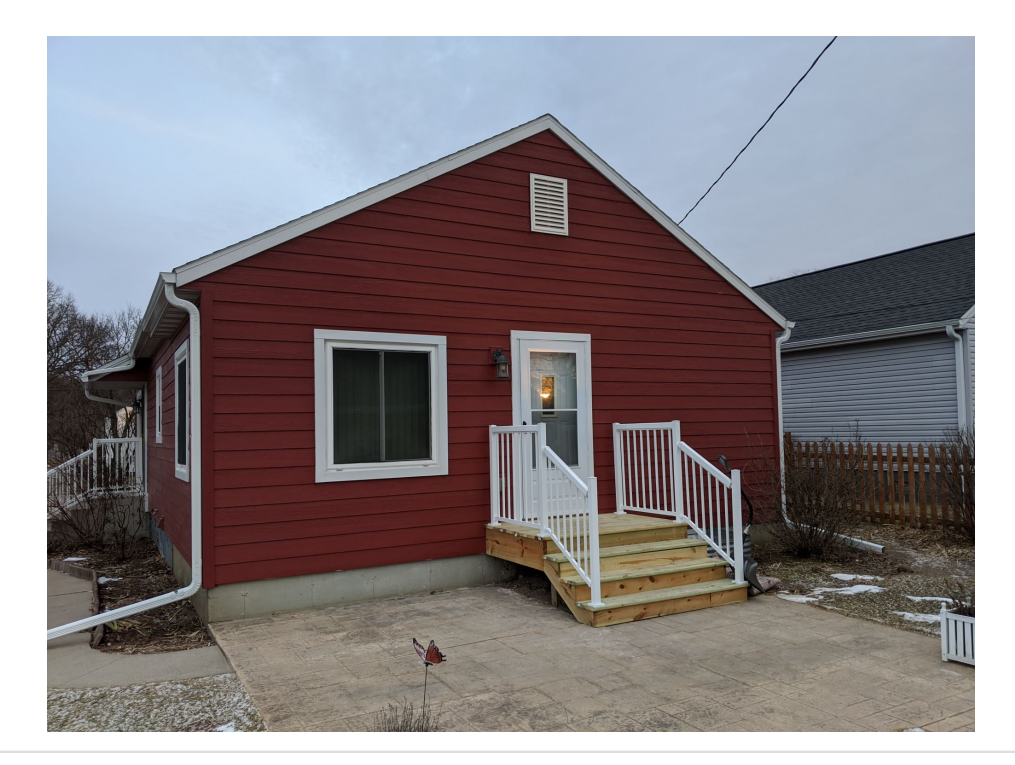
Uploaded: 1/9/2020 Kevin Conroy