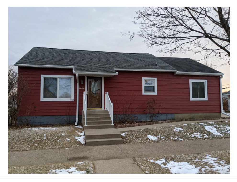
Uploaded: 1/9/2020 Kevin Conroy