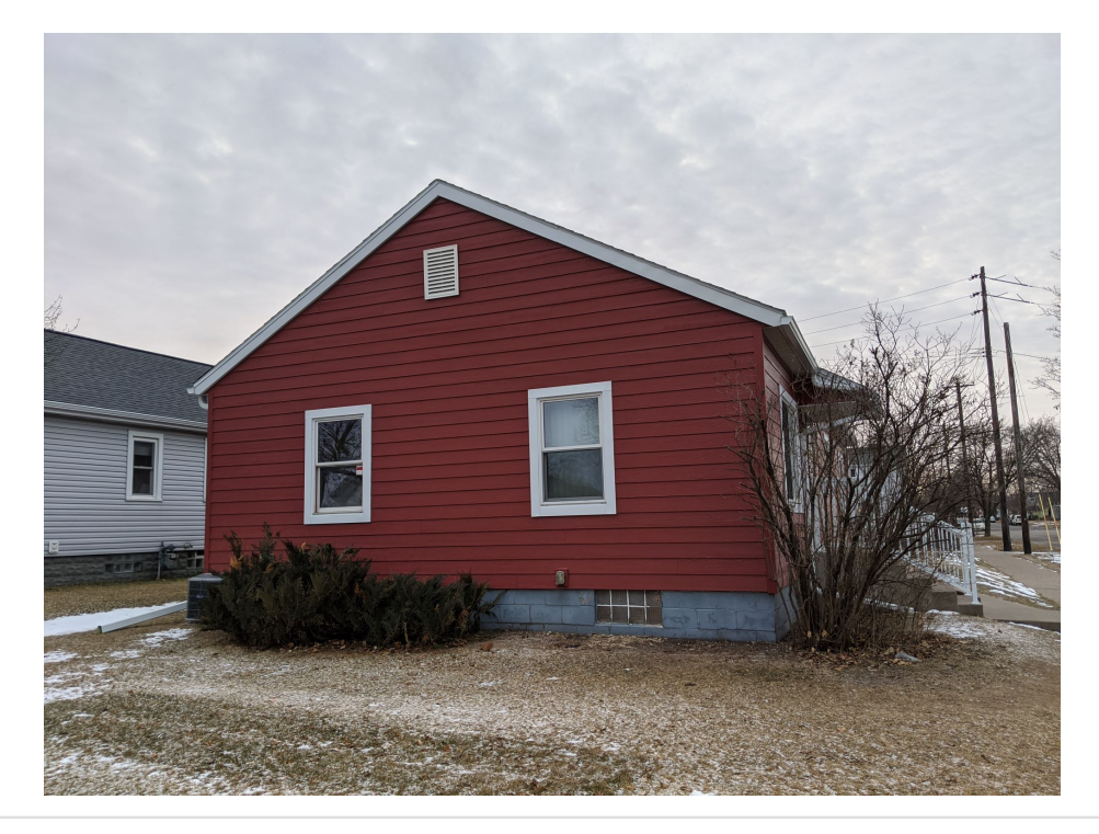
Uploaded: 1/9/2020 Kevin Conroy