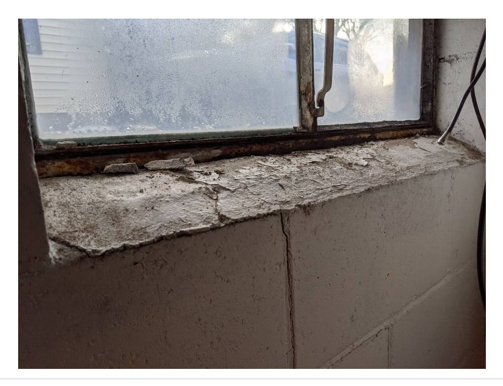
Uploaded: 2/5/2020 Kevin Conroy