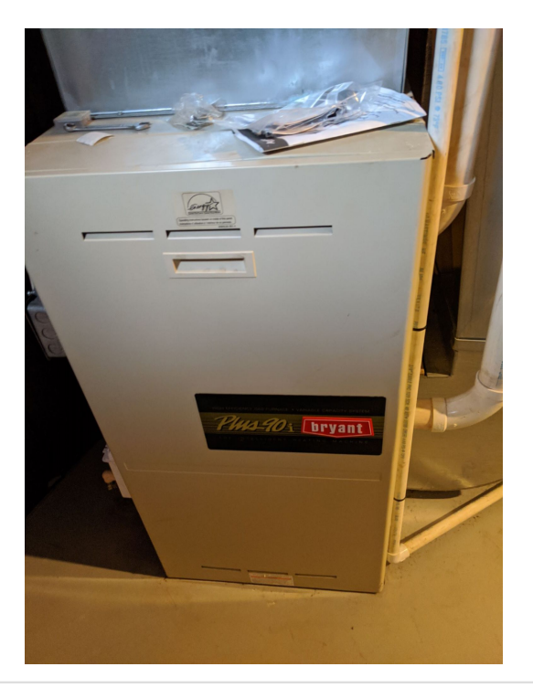
Uploaded: 2/5/2020 Kevin Conroy