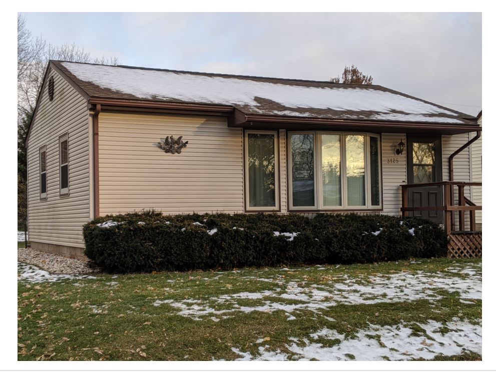
Uploaded: 2/5/2020 Kevin Conroy