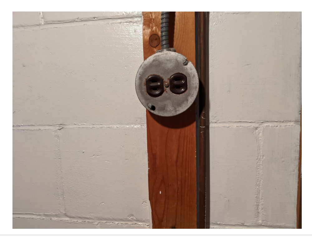
Uploaded: 2/5/2020 Kevin Conroy