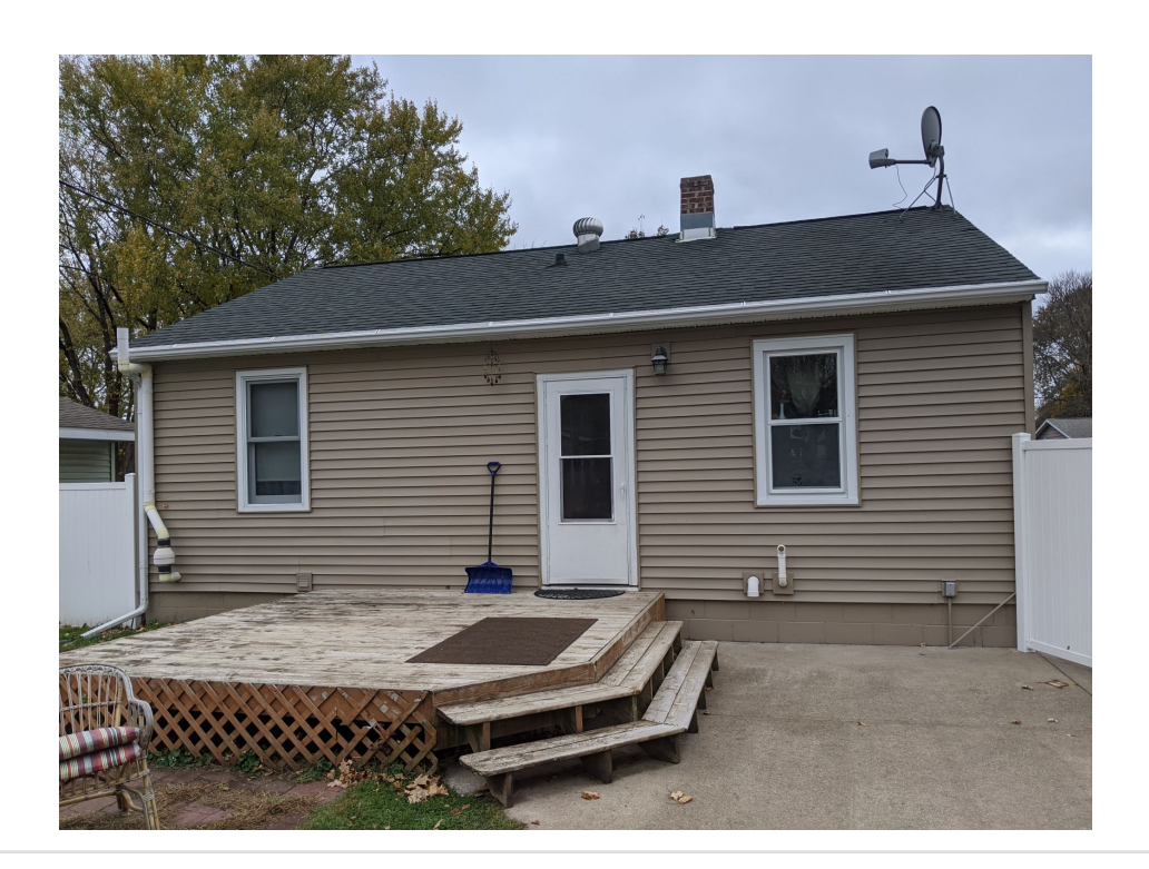
Uploaded: 11/2/2020 Kevin Conroy