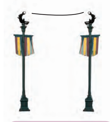
Poles could be used instead of arches and placed on either side of the alleys to anchor wires for stringing lights. They would also serve to display banners.

lighted at night much in the same way. Major stakeholders on each block of Pearl St. have shown interest in sponsoring the lighting of this project.