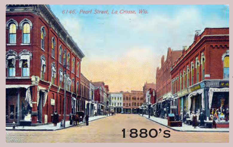
• In December 1916, the Union Train Depot was proposed and later built on the corner of Second and Pearl Streets, where the Holiday Inn is located today

• From the beginning, this cobblestone street stretched three blocks long and served as a vital connection from the Mississippi River levee's early steamboat commerce to central downtown with both pedestrian and street traffic.