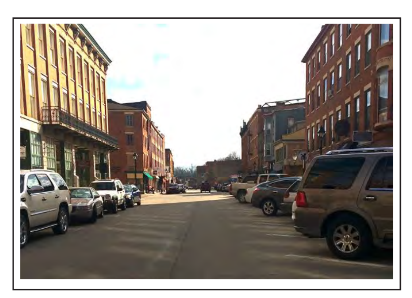
Galena, Illinois & Wabasha, MN are two of the many historic towns that maintain angled parking without difficulties.

The city's 2015 transportaion plan identified the need to slow traffic, make the street pedistrian friendly & establish shared spaces. We feel the best way to accomplish this immediately with minimal expense is by establishing a new parking design for the street; a return to a combination of paralell and angled parking.