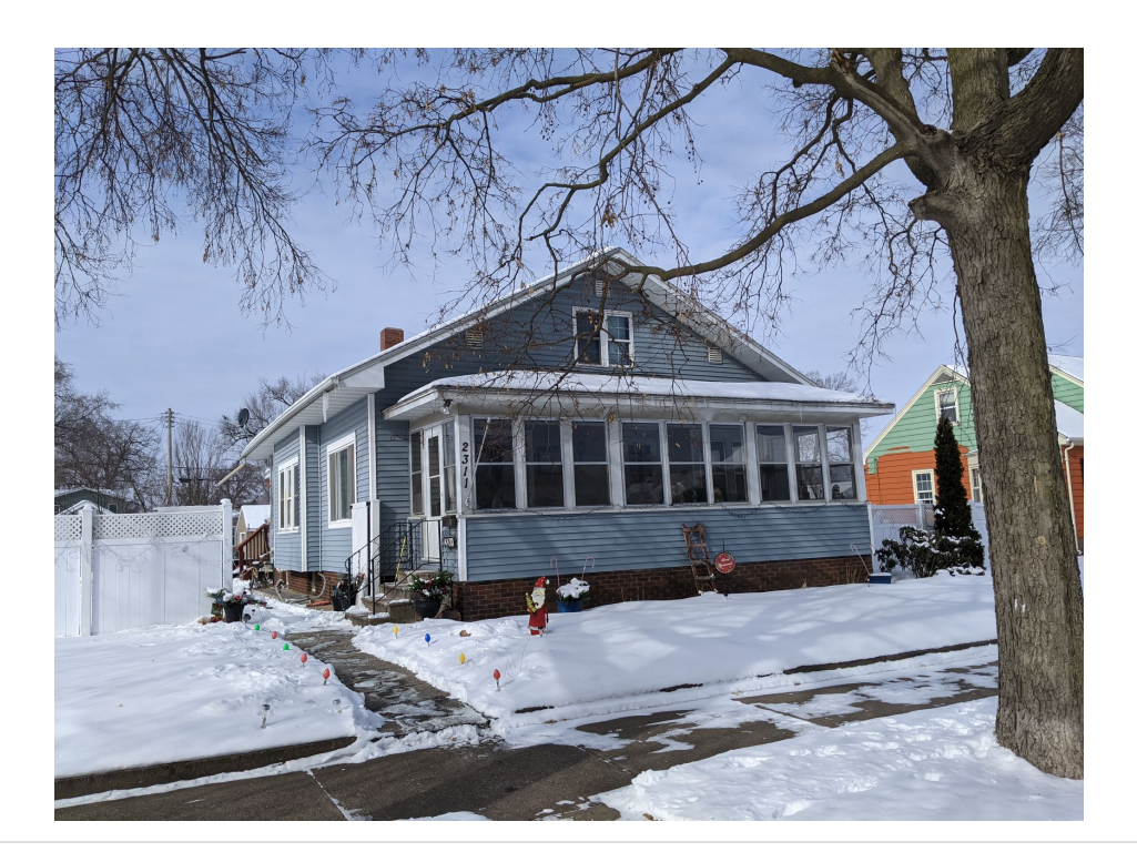
Uploaded: 3/17/2021 Kevin Conroy