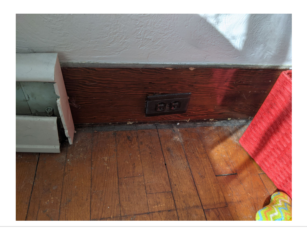
Uploaded: 3/17/2021 Kevin Conroy