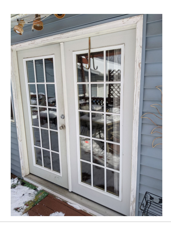
Uploaded: 3/17/2021 Kevin Conroy