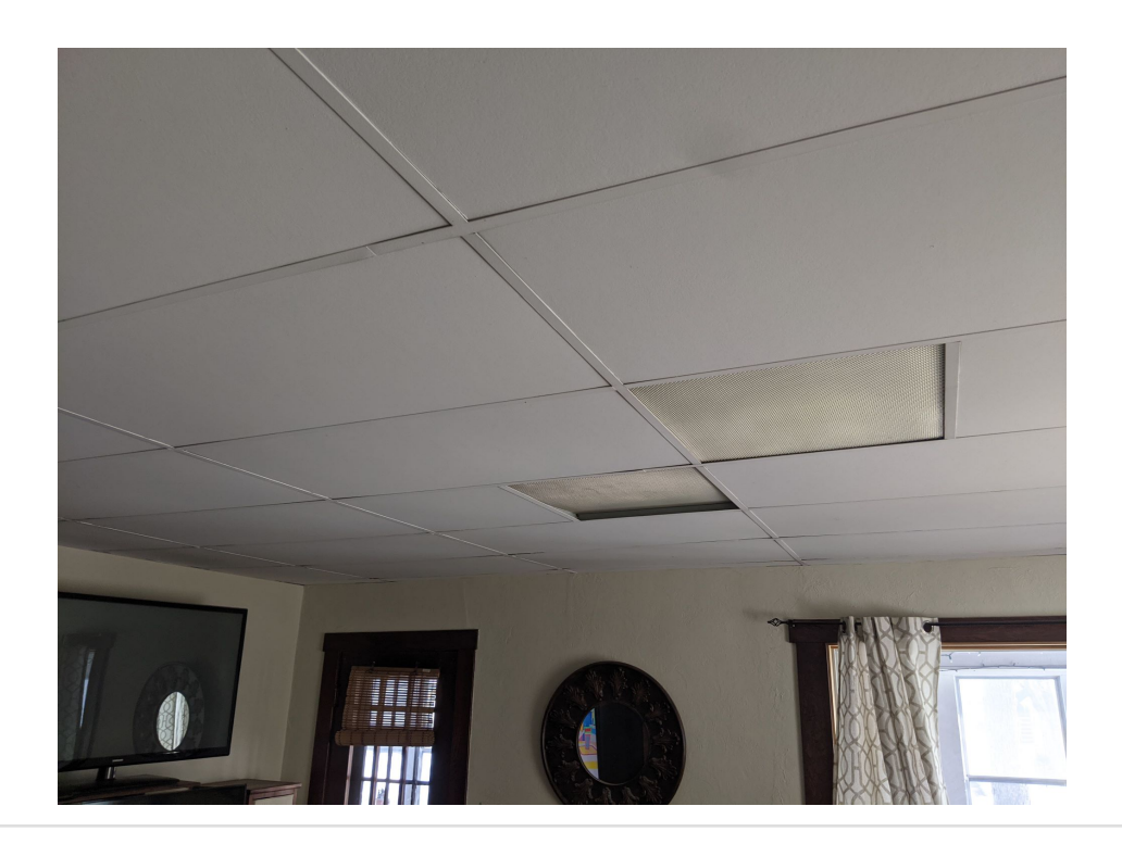
Uploaded: 3/17/2021 Kevin Conroy