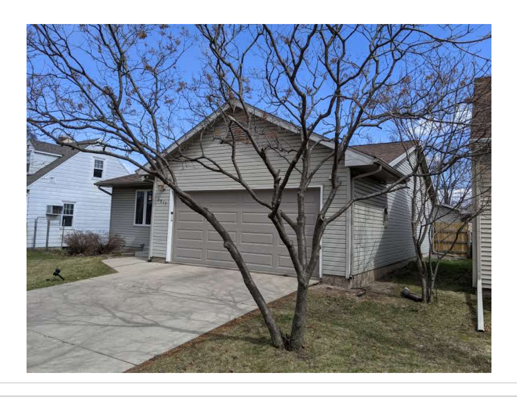
Uploaded: 4/2/2021 Kevin Conroy