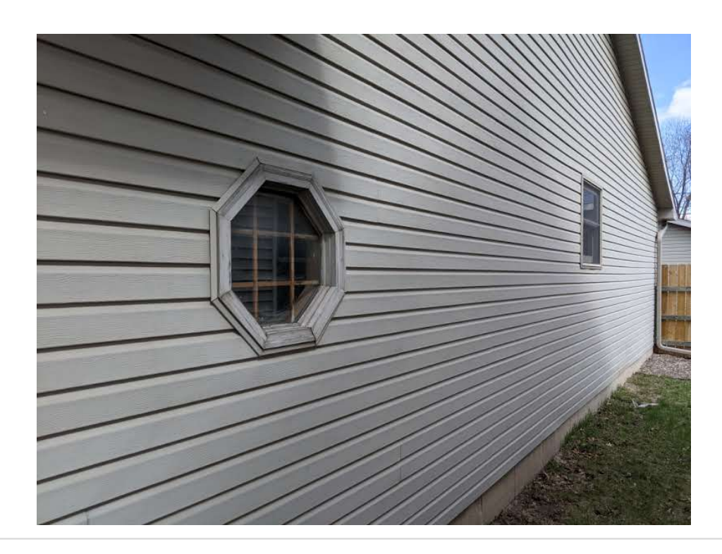
Uploaded: 4/2/2021 Kevin Conroy