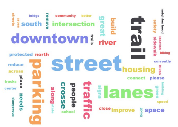
Figure 3: Word cloud showing most popular words from the comment map (larger words are mentioned the most frequently)