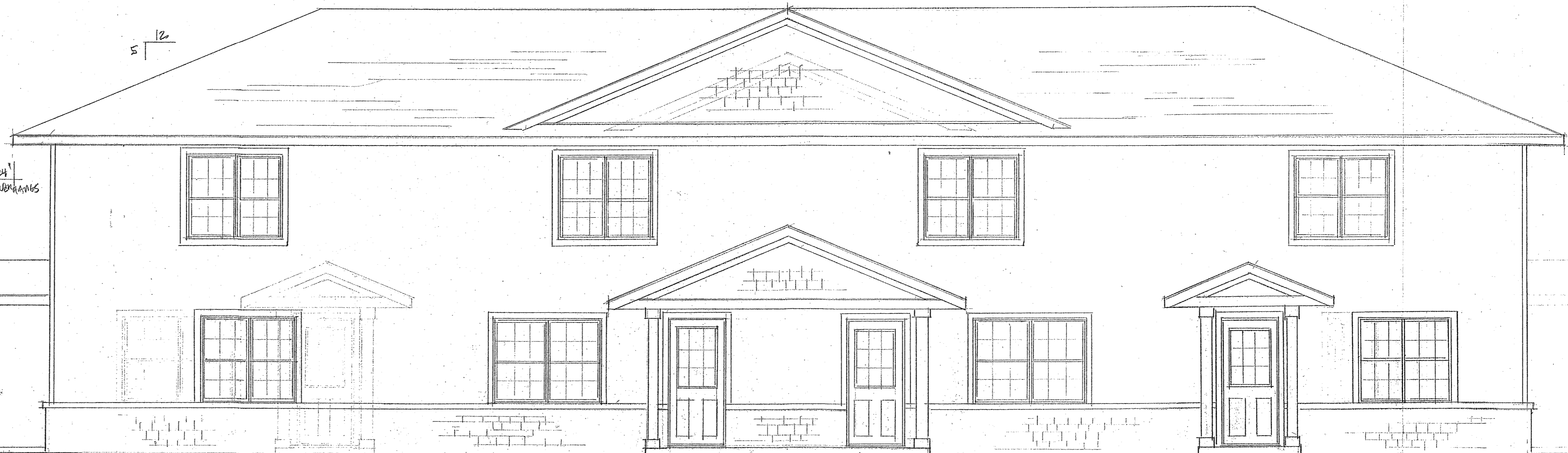
FRONT ELEVATION (NOT TO SCALE)