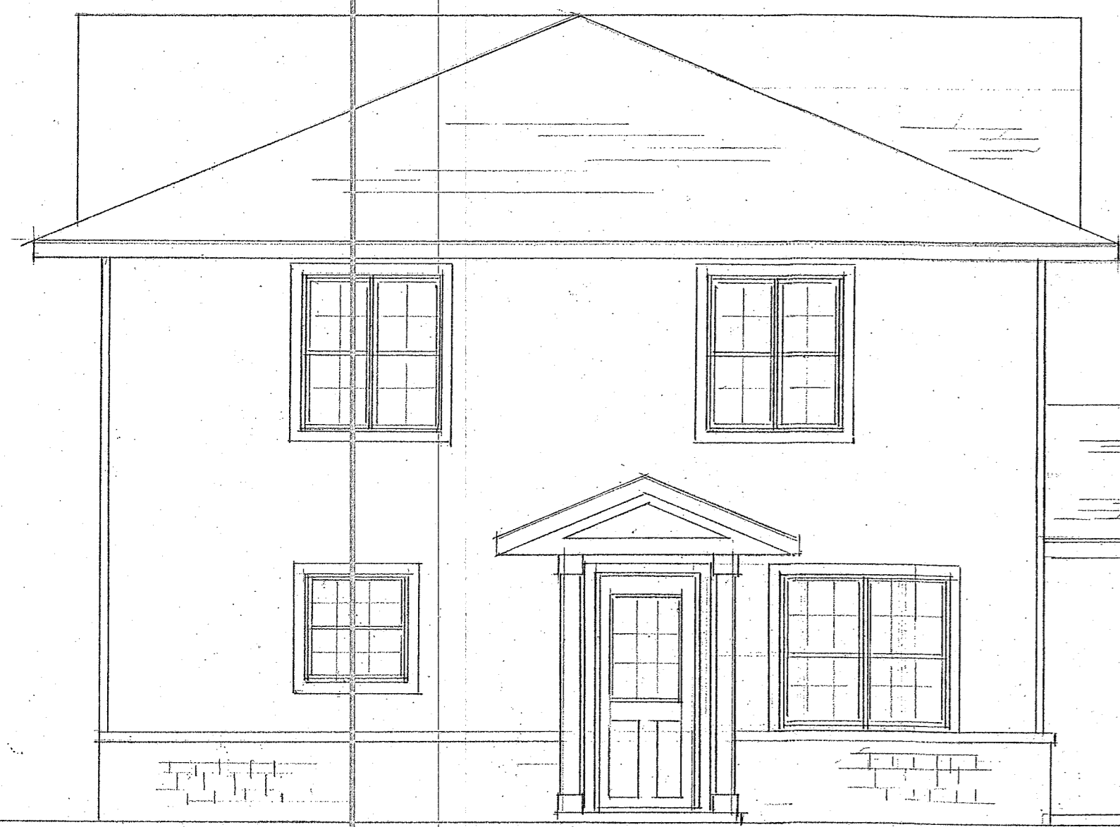
DENTON ST. STREET ELEVATION