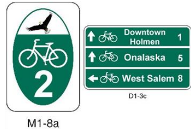
Figure 3: Example bicycle guide sign, Manual on Uniform Traffic Control Devices.