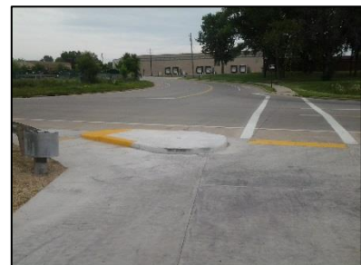
Figure 2: Picture of the Nature Trail’s terminus at Oak St/Enterprise Ave, looking east up Enterprise Ave.