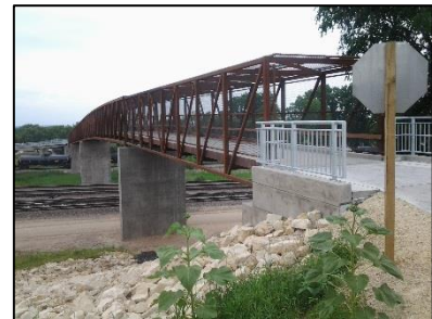
Figure 1: Picture of the Nature Trail bridge taken from its terminus at Oak St/Enterprise Ave and looking west toward its terminus near Hamilton Rd and Salem Rd.

The Trail’s southern terminus at Gillette St is approximately 120 feet east of the Gillette St/Onalaska Ave/Ranger Dr intersection and poses some signage and maneuvering challenges for users to connect to the bike lanes on Ranger Dr. The better alternative is to exit the Nature Trail at Credit Union Ct and then use Onalaska Ave as the connection to Ranger Dr.