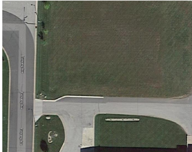
See well-maintained lot above. Picture on left taken 3/30/18. Image on right from Google-Maps circa 2016, note lawn-mower tracks showing that AFP currently maintains this property.