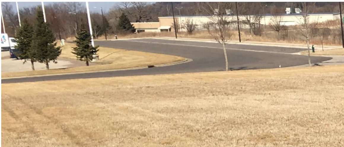
Note tracks above showing fertilizers application in fall of 2017.