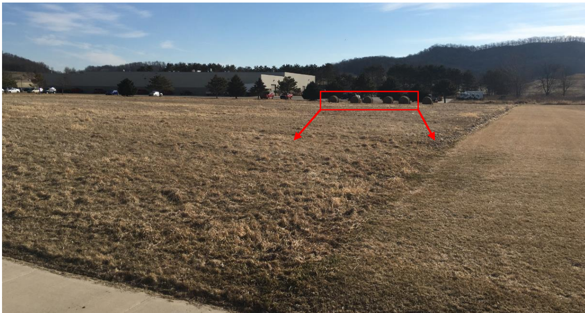
Note the round bales, Dalco maintained lawn on right, Lot D on left with Stansfield in background. This is the best this lot looks all year.