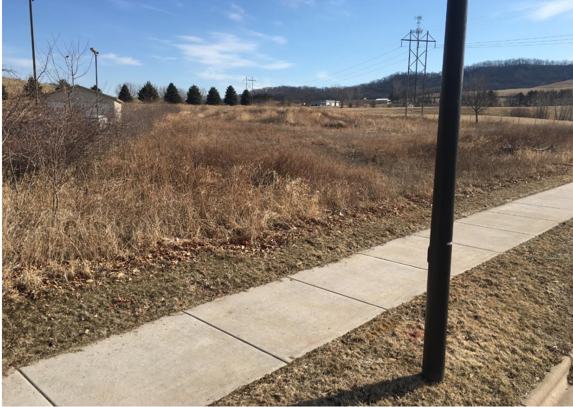
Creative Laminates maintained property (not seen) on left. Typical “vacant lot” prior to twice per year mowing.