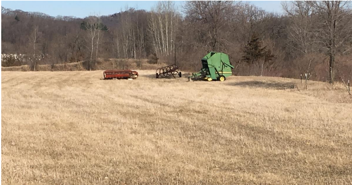
Note the haying equipment used and stored in this area.