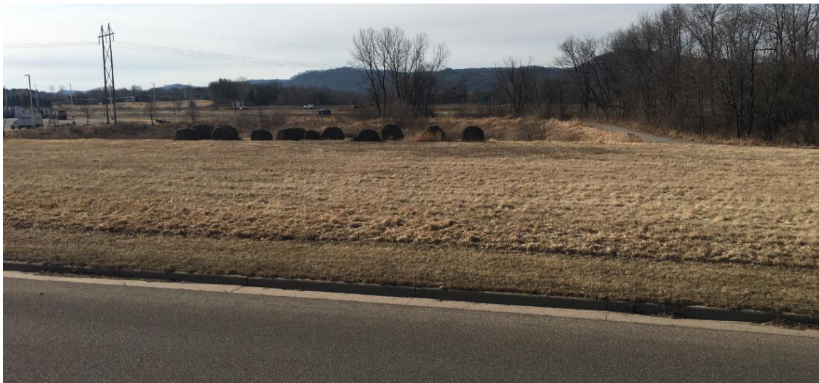
Interstate in background, round bales stored on site.