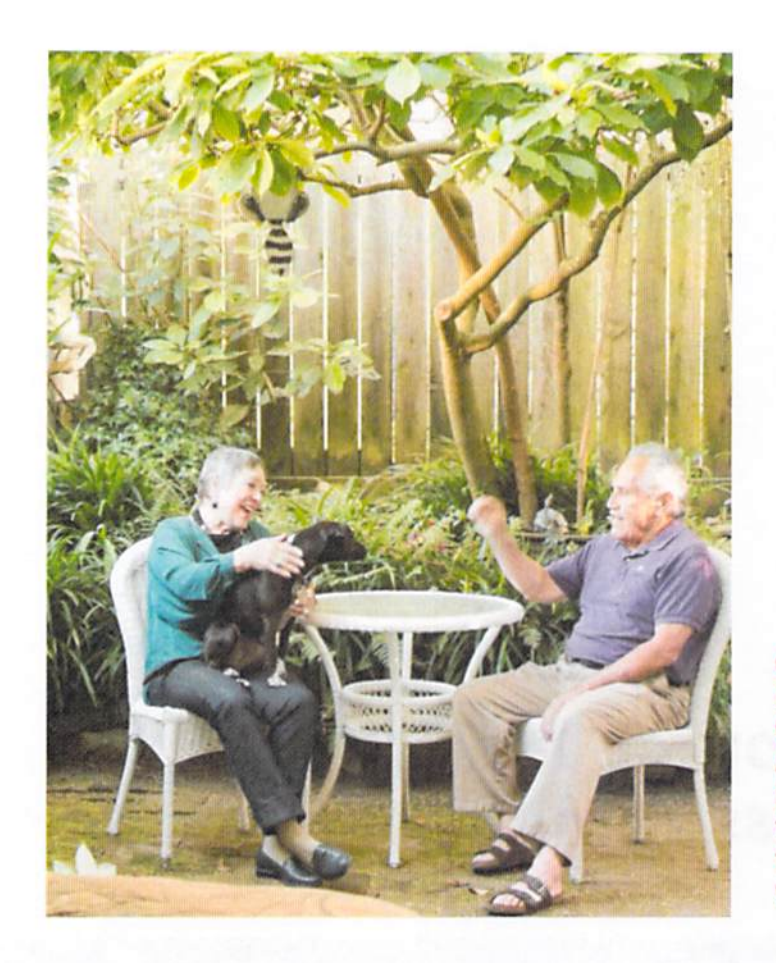
Good Neighbors On average, Airbnb hosts have lived in their hometowns for almost 20 years.

For millions of immigrants, the long journey toward the American Dream went past Ellis Island and the Statue of Liberty. These families came to the United States searching for a better life in a land full of opportunity, where happiness and financial stability could be achieved through hard work.