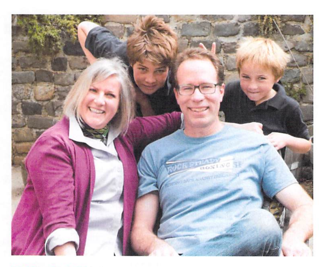
Making Ends Meet Money earned from home sharing helps nearly 60% of Airbnb hosts stay in their homes.

Policymakers are taking notice and acting to support home sharing and the middle class. Today, Jersey City — less than half a mile from the Statue of Liberty — proposed new legislation that would make the City the first location in the tri-state area to pass common sense home sharing laws. Jersey City has a robust history as a hub for middle class families and we appreciate city leaders' work to pass progressive rules that support working men and women.