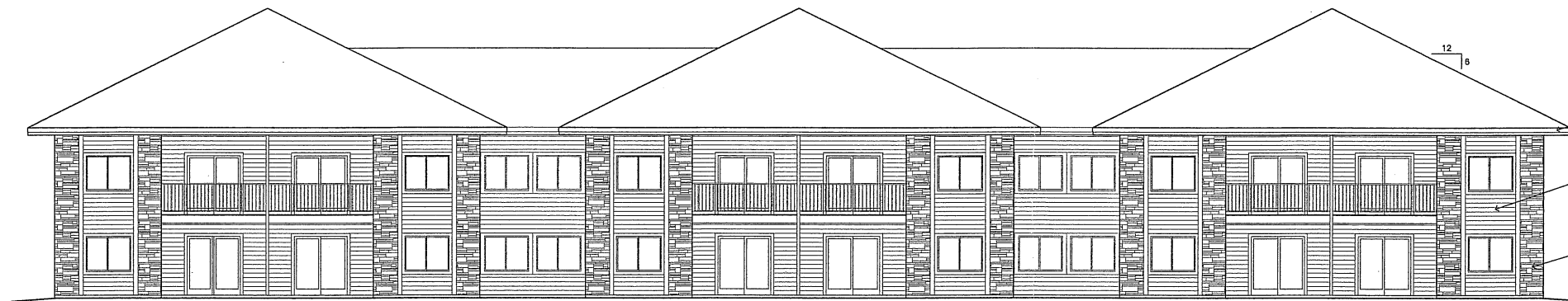
2 SOUTH EXTERIOR ELEVATION A3 1/8" = 1'-0"

PREFINISHED ALUMINUM FASCIA AND SOFFIT HORIZONTALLY APPLIED METAL SIDING STONE VENEER AND STONE CAP