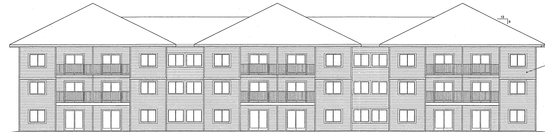
1 NORTH EXTERIOR ELEVATION A3 1/8" = 1'-0"

PREFINISHED ALUMINUM FASCIA AND SOFFIT HORIZONTALLY APPLIED METAL SIDING STONE VENEER AND STONE CAP