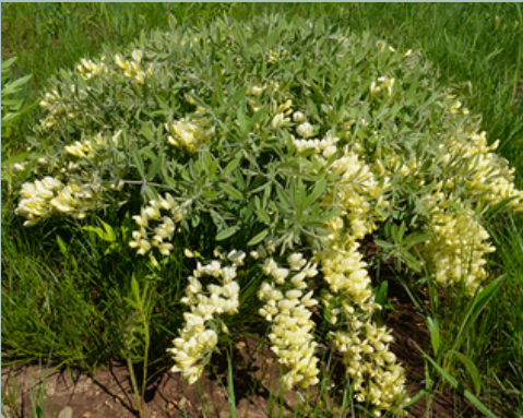
CREAM WILD INDIGO