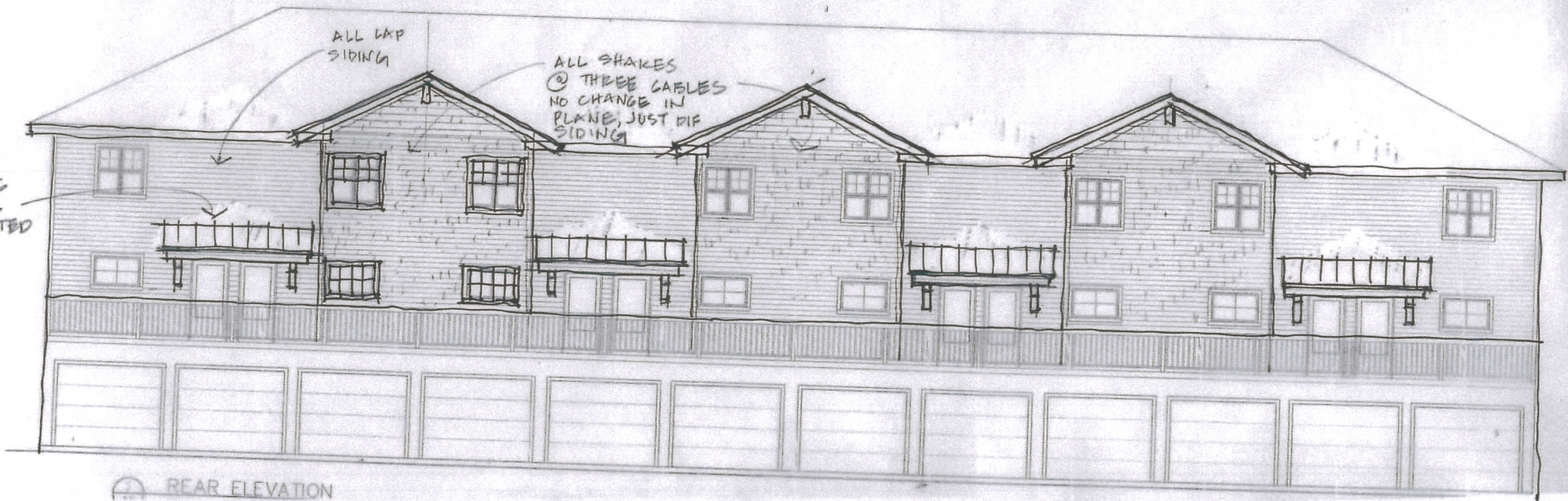
2 REAR ELEVATION