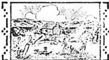
THE ABOVE IS A SKETCH OF THE FIRST LA CROSSE POST OFFICE. ESTABLISHED 1844. NATHAN MYRICK FIRST WHITE SETTLER. ALSO FIRST POSTMASTER

LA CROSSE, WISCONSIN Participating in NATIONAL AIR MAIL WEEK MAY 15 TO 21, 1938