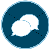
PRINCIPLE #4: Foster Sustainability + Resiliency

Enhance the neighborhood character, access to the Black River, and create a memorable gateway to the City. Relate new developments to the physical scale and character of the neighborhoods. Create a corridor that residents and visitors can understand and easily navigate by creating memorable landmarks, destinations, aesthetics, and sense of place.