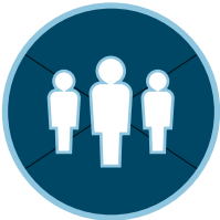
PRINCIPLE #2: Strive for Diversity

Design to heighten the human experience and connection to the sense of place. Create enhanced connections between neighborhoods, businesses, recreation, and natural surroundings.