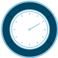
PRINCIPLE #1: Advance Livability

A series of urban design principles and a design concept were defined early in the planning process. They inform the development of designs and recommendations to assist in the prioritization of potential implementation strategies and projects.