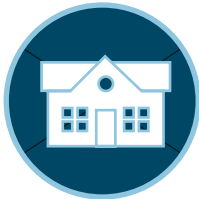
PRINCIPLE #3: Promote Neighborhoods

Encourage diverse uses, buildings, and environments to promote inclusivity and access.