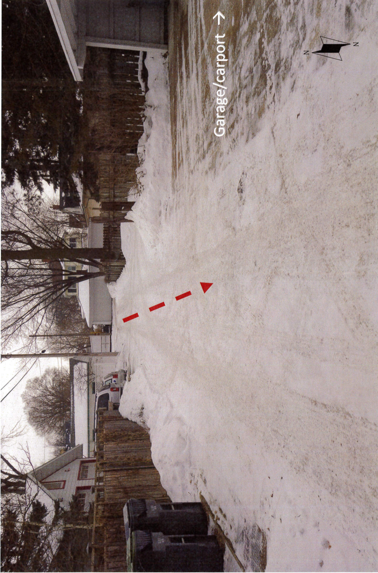
Looking south along gravel section of alley proposed to be paved. Red arrow shows direction of drainage to the north toward garage/carport. 2/21/2015