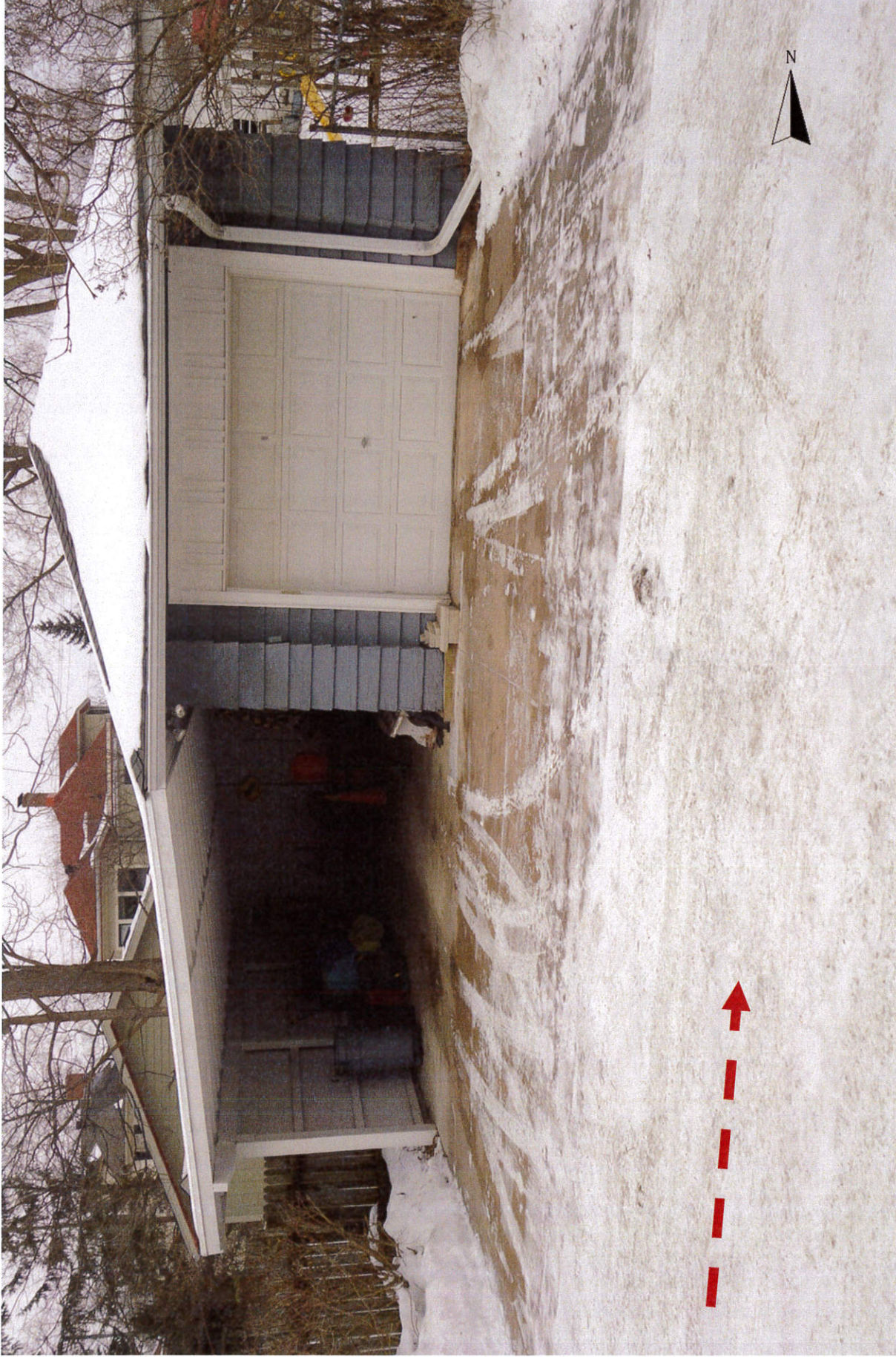
Looking west at garage/carpport for 120 17 th Street South. Gravel section of alley proposed to be paved is located in foreground under snow. Red arrow shows direction of drainage to the north. 2/21/2015