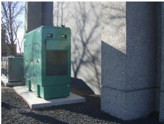
City Hall Generator Installation