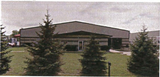
BEFORE - NOT TO SCALE