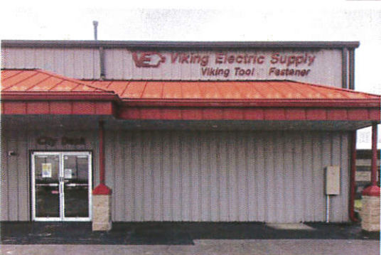
BEFORE - NOT TO SCALE