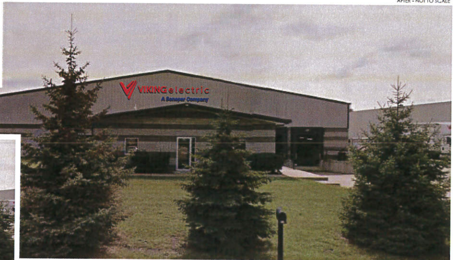
AFTER - NOT TO SCALE