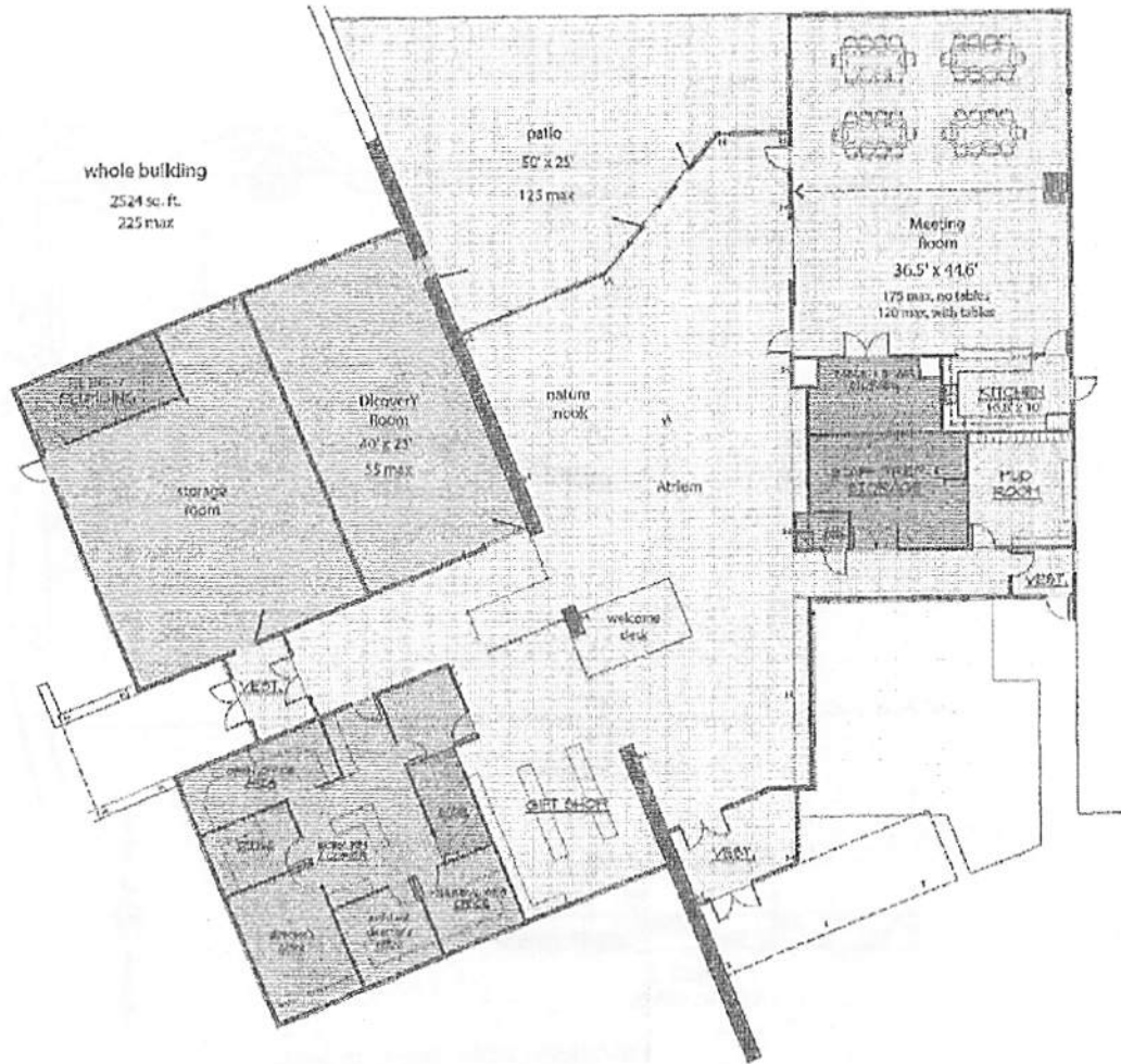
EXHIBIT "B" Floor Plan