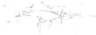
View from South with Material Palette