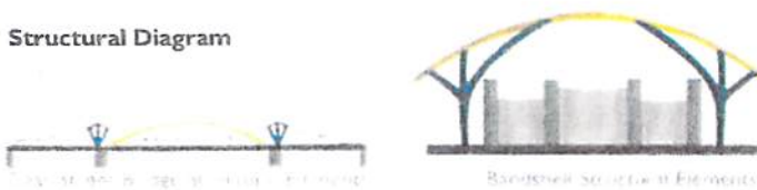
Bandshell structure in elevation

Design Concept: Our bandshell design reflects the graceful arch and trusses of La Crosse's iconic paired bridges, complimenting and reinforcing the city's brand and Riverside Park as the city's living room. WholeTrees proposes to harvest resilient and rot-resistant white oak trees from local forests, and design and engineer custom timber trusses. A wooden shell-roof structure floats well-over the preserved historic stone bandstand protecting it and the performers from rain and sun. Acoustic hardwoods reflect sound to the audience and performers while providing a warm locally sourced ceiling. Proposed roof materials are durable fish-scale copper or a living roof. Additional bathrooms, greenrooms and storage are added to the south with complimentary roof forms and walls emulating the bandstand.