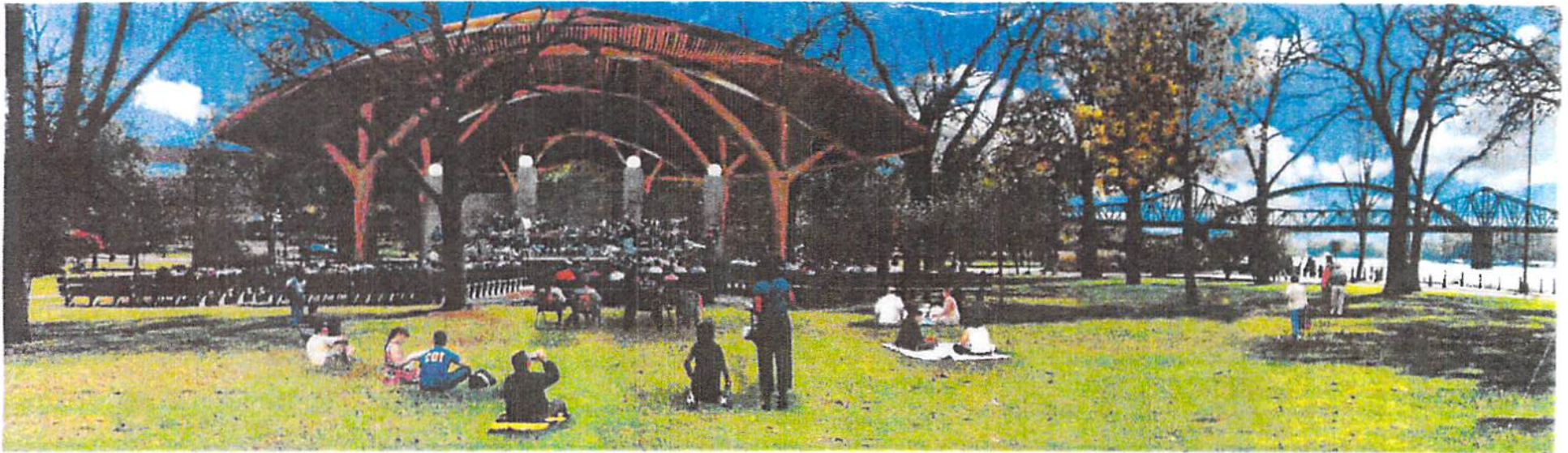
Rendering of Historic Wendell & Anderson Bandstand with New Acoustical Shell