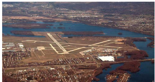
La Crosse Regional Airport