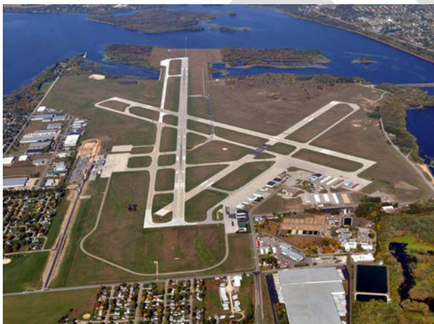
La Crosse Regional Airport

Convenient access to airline passenger service, air cargo facilities and corporate aviation allows businesses to safely and efficiently move key personnel and products, saving valuable time and increasing productivity.