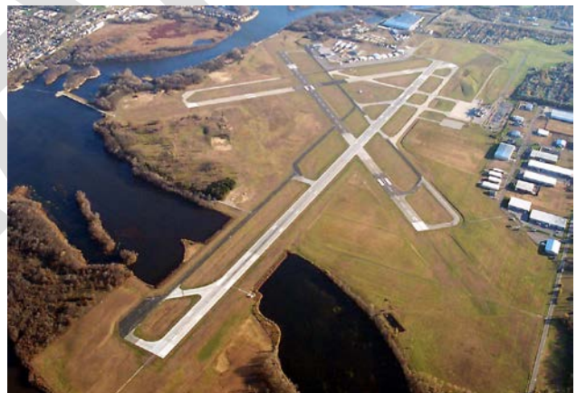
La Crosse Regional Airport

Note: The results of this report are produced from a basic model and do not completely address all the economic nuances facing every airport.