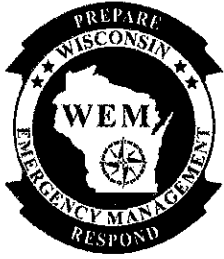
EXHIBIT C Wisconsin Hazardous Materials Response System