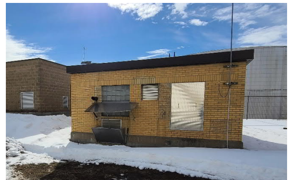
Existing Hagar Pumping Station.

As discussed in detail over the phone, Wisconsin Administrative Code Chapter NR110, specifically NR110.14, (3), (e) and NR110.14 (5), (c), 2 require that the electrical equipment located in areas where hazardous gases may be present comply with National Electrical Code (NEC) requirements for Class I, Group D, Division 1 locations. Because the wet well is directly below the control room and there are hatches and other penetrations to the wet well, all the new electrical equipment in this space must be rated for Class I, Group D, Division 1 locations. Because this is not feasible, we discussed locating the new electrical equipment on the exterior of the building. However, after our conversations, we determined that the existing motor control center does not have a breaker for the new pump. Adding this breaker inside the building, even with the new controls located on the exterior of the building, would not comply with this code.