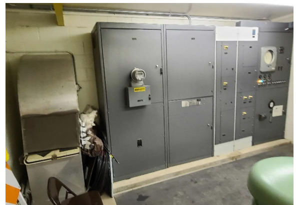
Electrical gear lineup.

One idea for keeping the station in service during construction is to utilize the existing generator to power the pumping station while the first section (farthest left section) of the electrical gear is removed and a new service entrance rated automatic transfer switch (ATS) is installed in its place. The new ATS will be temporarily wired to the two existing motor control center (MCC) sections and then energized from the Utility service. This work could likely be completed in a single workday. The next step will remove the existing ATS section (second section from the left) of the electrical gear and install one of the new pump starter MCC sections in its place. Extra lugs will be specified on the ATS to allow the ATS to feed this new MCC section as well as the existing MCC sections. If desired, the existing generator could be temporarily wired to the new service entrance ATS at this time to provide backup power to the station. This second step could also likely be completed in a single workday. The final step in replacing the electrical gear is to remove the two existing MCC sections and install the remaining new MCC sections. Since one new pump starter will have been installed in step two, one of the two pumps will be operational during this step. Like the other two steps, this work could likely be completed in a single workday.