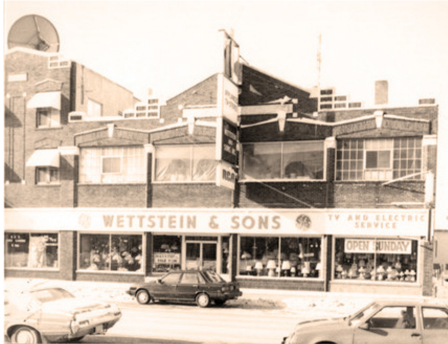
Historic Image B