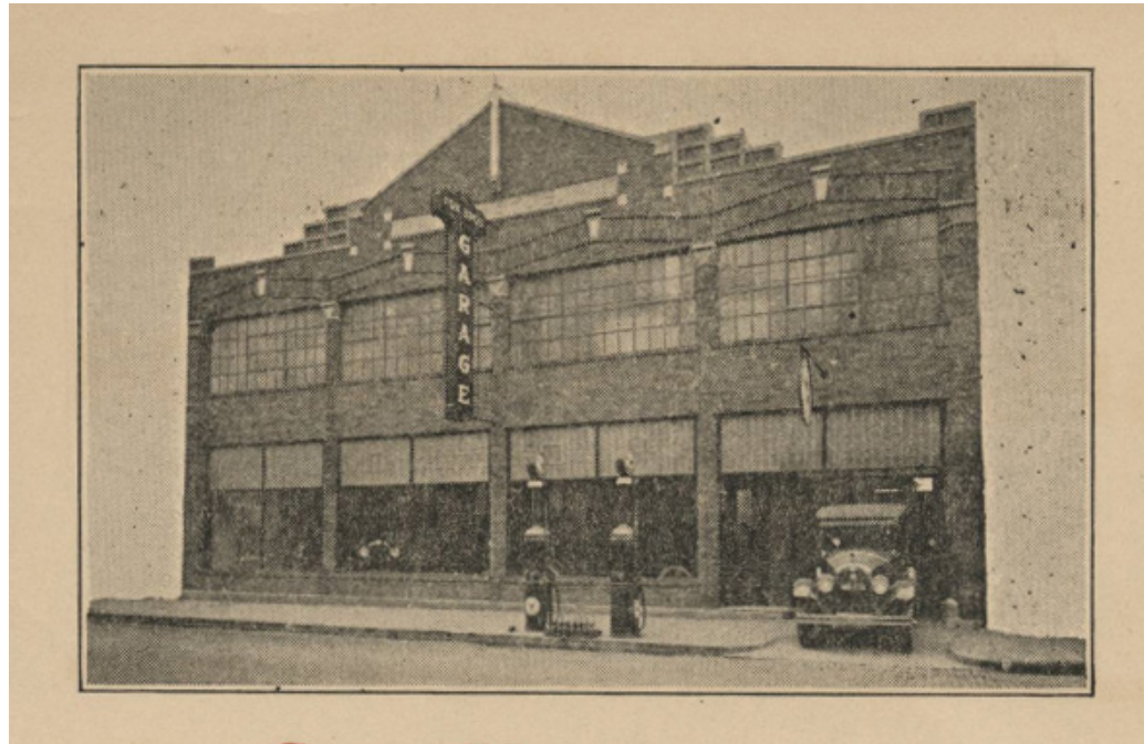
Historic Image A